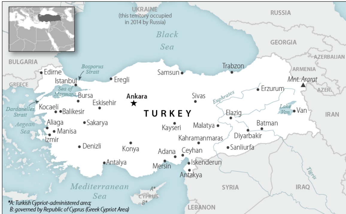
Figure I. Turkey at a Glance

According to the Turkish Coalition of America, a non-governmental organization that promotes positive Turkish-American relations, as of August 2016, there are at least 150 Members of the House of Representatives (145 of whom are voting Members) and four Senators in the Congressional Caucus on Turkey and Turkish Americans. 1