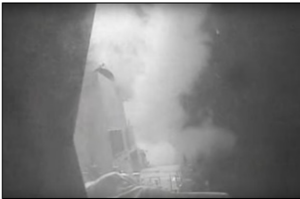
A Tomahawk Land Attack Missile Launched from USS Nitze against Houthi-Saleh radar.

Claiming self-defense, the USS Nitze fires Tomahawk cruise missiles at three Houthi-Saleh-controlled radar installations, A Pentagon spokesperson says, "These limited self-defense strikes were conducted to protect our personnel, our ships and our freedom of navigation in this important maritime passageway," Other U.S. officials reiterate that U.S. actions do not indicate deeper U.S. support for the Saudi-led coalition or deeper military involvement in the conflict.