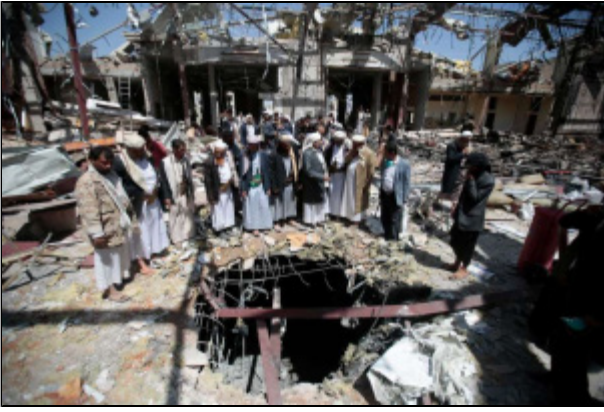
Destroyed great hall of ceremonies on al-Khamseen Street in Sana'a.

Houthi political and military figures are killed , as well as dozens of civilians.