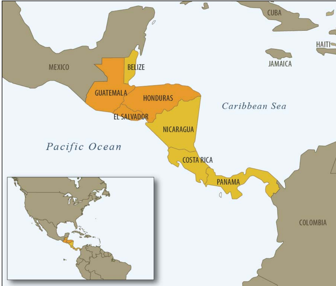
Figure 2. Map of Central America and Neighboring Countries