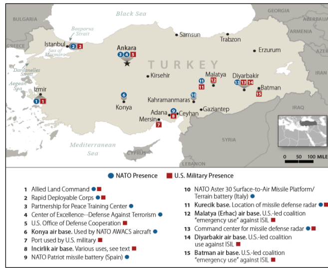
Figure 2. Map of U.S. and NATO Military Presence in Turkey