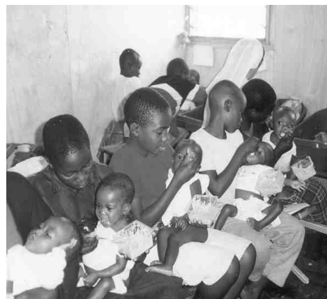
Recreating a family-like environment in an institution is important to the well-being of babies and young children. Goma, United Republic of Tanzania.