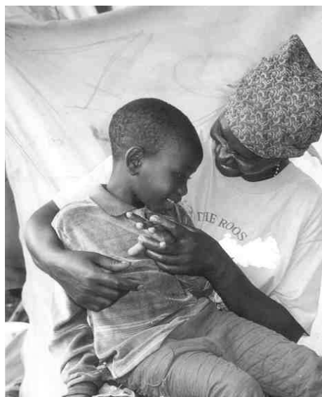
Mother and child reunited through photo-tracing. Goma, United Republic of Tanzania.