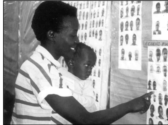
Displaying photographs rekindles a parent or relative's hope of tracing and finding their lost child. Goma, United Republic of Tanzania.

A successful tracing programme must have a central repository where all information about possible whereabouts of family members is collated. Information on children, parents and other relatives may be derived from a variety of sources, including distant locations hundred of miles away and across borders, and must be validated against existing information in the central tracing location.