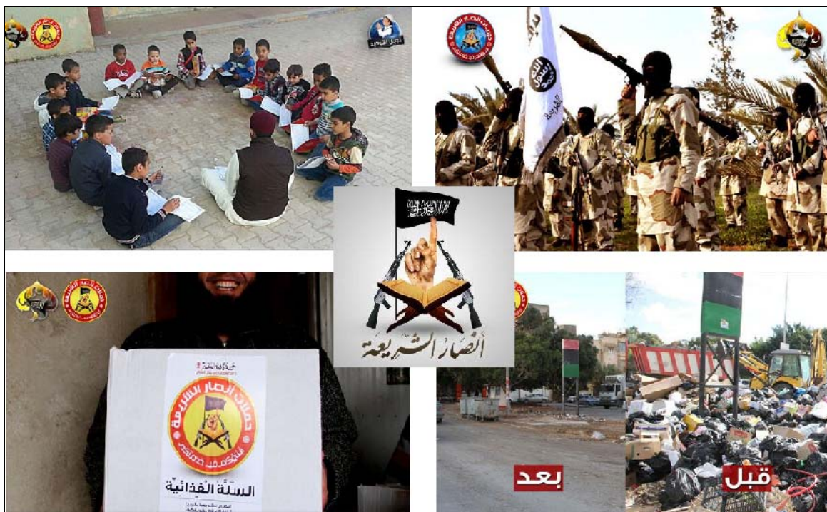
Figure 3. Recent Ansar al Sharia Imagery from Libya and Syria