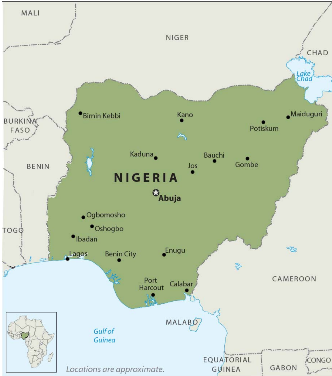
Figure 2. Map of Nigeria