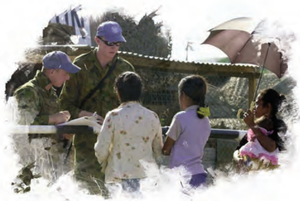
East Timorese women speaking to peacekeepers providing security at the border.

The roll-out and distribution of this knowledge product, financed by the Government of Australia, will include the development of training material as part of a package being developed by DPKO Integrated Training Service (ITS) on the protection of civilians. There will also be continuing capture of the kinds of tactics identified in this paper to build a “bank” of good practice. Indeed, since this process began, there has been a virtuous cycle of increased attention to sexual violence leading to more concerted efforts on the ground.