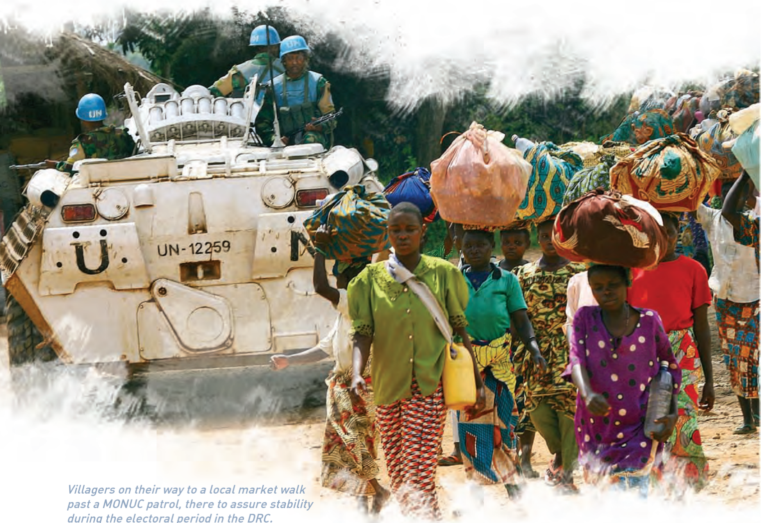
Villagers on their way to a local market walk past a MONUC patrol, there to assure stability during the electoral period in the DRC.