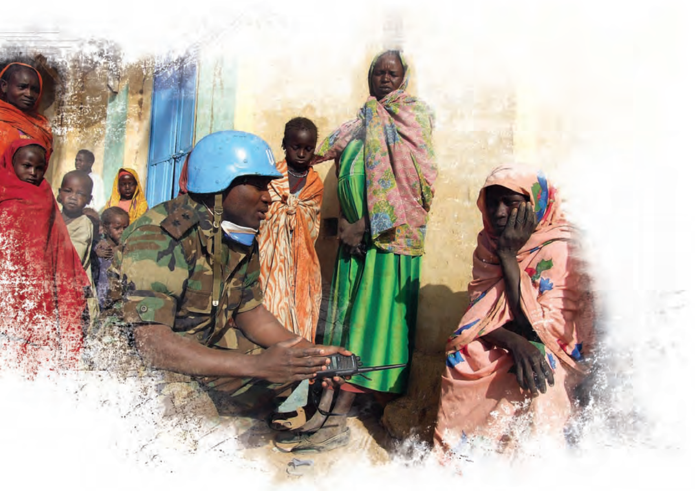
A UNAMID peacekeeper on patrol consults a woman regarding her concerns.