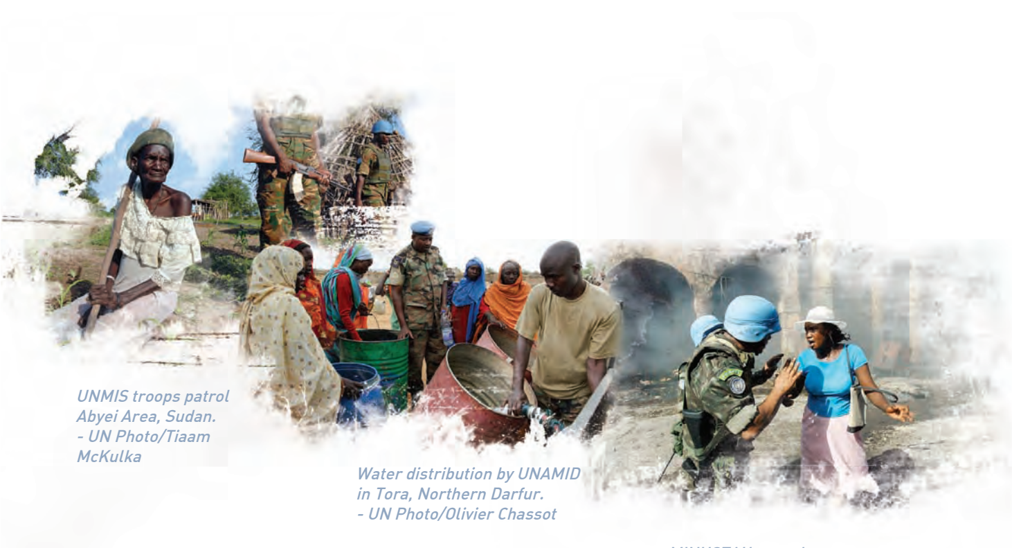
UNMIS troops patrol Abyei Area, Sudan.