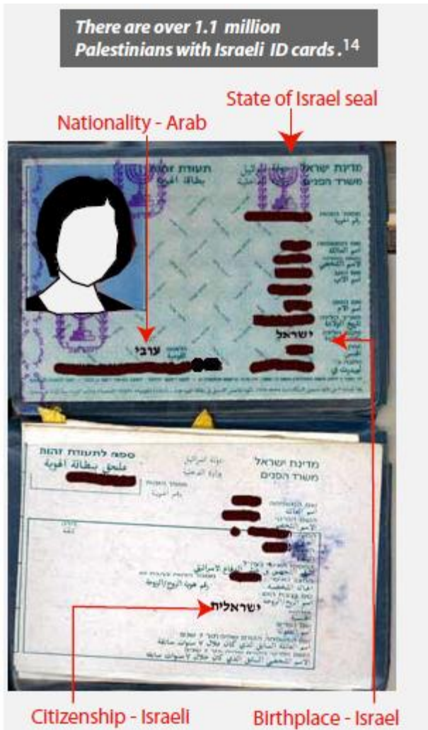
[The footnote ‘14’ above refers to the original source]

“Palestinians with Israeli ID cards are considered citizens of Israel. The Israeli Government, categorises Israeli citizens by religious and national-ethnic affiliation. Each Israeli ID card states in the nationality section whether the citizen is a Jew, Arab, Druze or a member of other ethnic groups. In April 2002, the Israeli Ministry of Interior issued new regulations which leave the ‘nationality’ section blank. This change affected only newly-issued ID cards. Most ID cards still in use list the national-ethnic or religious identity. The bottom half of the ID card lists citizenship as Israeli.