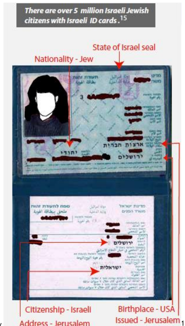
[The footnote ‘15’ above refers to the original source]

“These cardholders have total access to Jerusalem and freedom of movement in most of the West Bank. Although a holder of an Israeli ID card, someone listed as ‘Arab’ is more likely to be questioned, delayed and at times denied access. While there is no restriction on the movement of persons with Israeli ID cards, there is a military order prohibiting entry into West Bank Palestinian cities. The Jerusalem Wall will restrict their movement in Palestinian areas.” [54a]