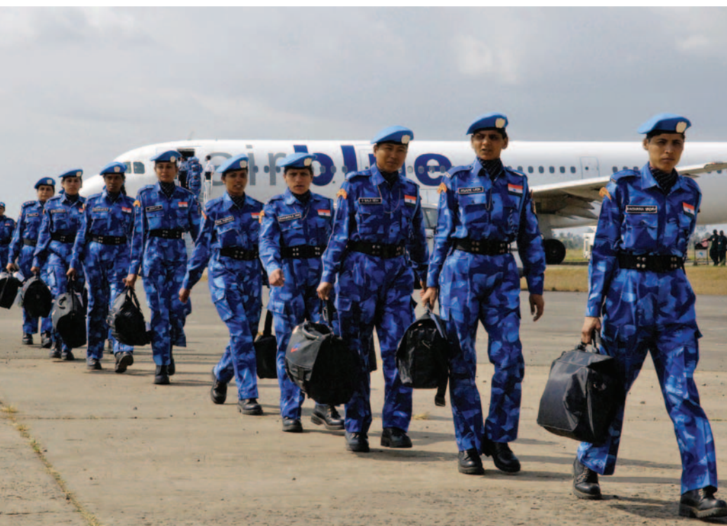
The UN's first all-female peacekeeping force arrives in Liberia.