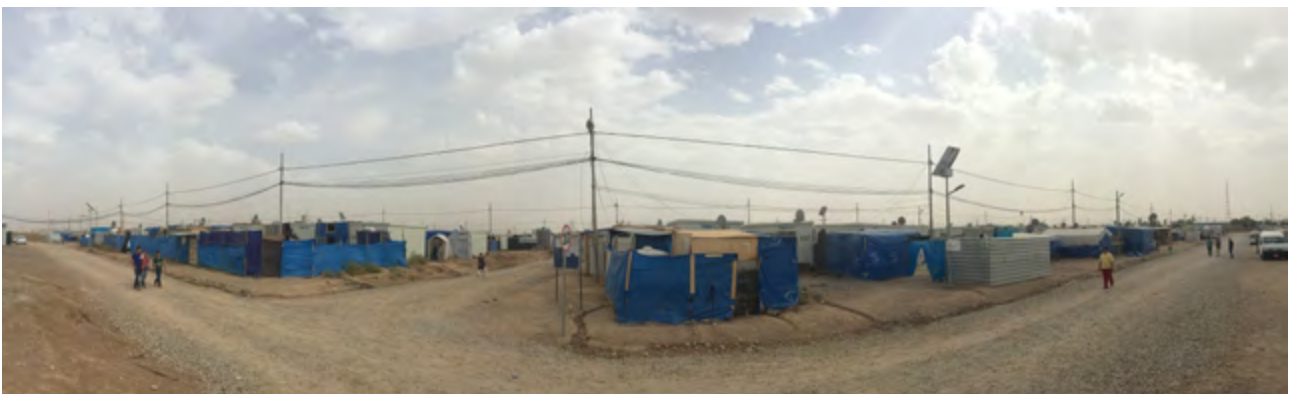
A view of an IDP camp in Erbil, Kurdistan. IDMC/S. Kilani, May 2015

According to the UN and IOM as of June 2015 8.2 million people were in need of humanitarian assistance ( ECHO, June 2015 ). In August 2014, the UN declared Iraq emergency to be at crisis level 3 (L3), the highest designation on its internal scale. Since the announcement, multiple assessments have been initiated to evaluate and prioritise humanitarian needs. However, as of June 2015, only 26 per cent of the $1.2 billion appeal covering operations from October 2014 to December 2015 had been funded ( OCHA FTS , 2015).