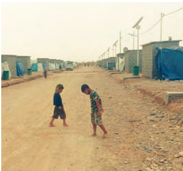
At least 50 per cent of IDPs in Iraq are children. IDMC/Sarah Kilani, May 2015

Restrictions on freedom of movement have led to family separation. For instance, the provincial authorities in Babylon have denied access to Sunni Arab males between the ages of 15 and 50, causing family separation as women and children were allowed access. ( OHCHR , 15 May 2015).