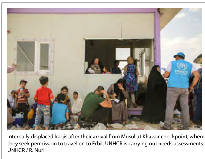
Internally displaced Iraqis after their arrival from Mosul at Khazair checkpoint, where they seek permission to travel on to Erbil. UNHCR is carrying out needs assessments.

Humanitarian access to areas beyond government or Kurdish control remains limited with IDPs in these areas being extremely hard-to-reach. In areas accessible to humanitarian organisations, assistance has been complicated by lack of documentation, and administrative challenges. Funding shortages resulting from lower oil revenues have seriously limited the capacity of the national authorities to respond. Other Middle Eastern crises (notably in Syria and Yemen) and donor fatigue have diminished prospects of sufficient international assistance to meet IDPs' humanitarian needs.