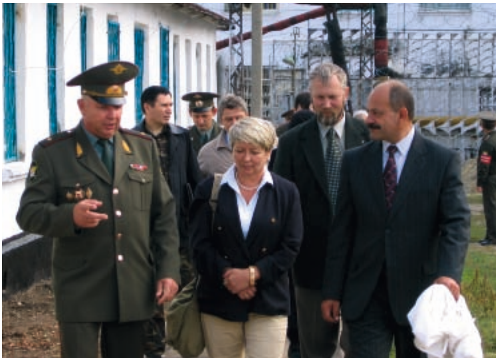
Inspecting a prison with local penitentiary system personnel in Krasnodarsky Krai, southern Russia, as part of an FCO-funded project

In the North Caucasus, funds from the Conflict Pool supports projects run by the NGO Article 19 and local NGOs working to enhance media professionalism and journalists' protection.