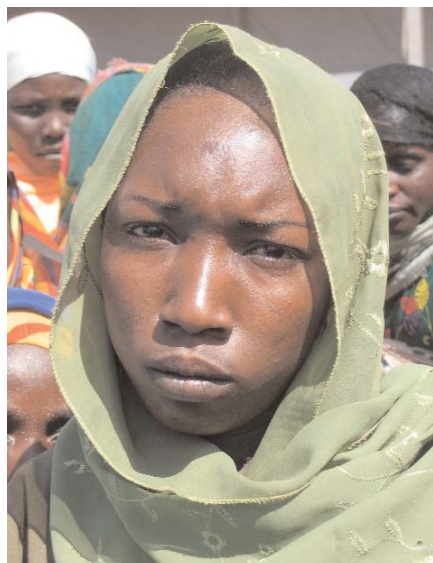
Spontaneous refugees, like this refugee woman, lived outside Farchana camp at the time of the Women’s Commission visit and did not have access to basic services.

UNHCR explained that the spontaneous arrivals had to be registered to ensure that they were all refugees before they could receive assistance and access services. UNESCO’s website states: