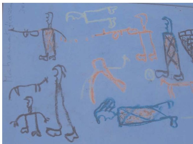
Children in Bredjing refugee camp drew pictures of what they saw in their villages in Darfur. Many of the pictures were similar to the one above.

CORD is developing a psychosocial program that begins by gathering youth to make traditional toys. After the children work for a few weeks on the toys, the program director begins to talk with the youth about their villages. She also shares stories of her life in her home town. The children then begin drawing pictures of their villages. The pictures contain images of planes dropping bombs, soldiers shooting people and fire. CORD