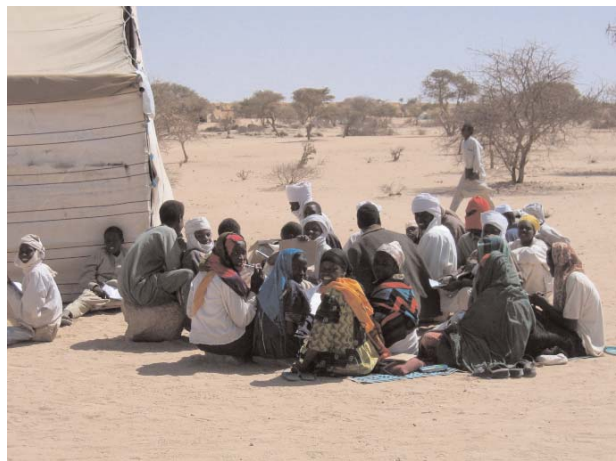
The refugee camps don’t have enough tents for classrooms, so often classes are held outside, like this class in Kounoungo refugee camp. Teachers in several camps said severe weather (heat, wind, cold, rain) keep children away from school. Some never return.

“We had to organize ourselves, to figure out the numbers of students who need school; then UNICEF would bring us the supplies, when we did this, they would bring blackboards and other supplies. The Minister of Education of Chad came. We started with school for those ages 10 and up. Then we made schools for children in P1 and P2. We did this, we made the education.” 68