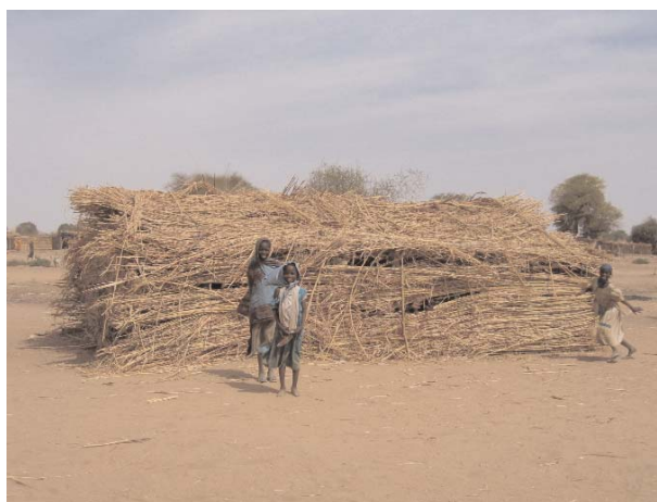
The community in Goz Amer refugee camp built structures out of straw for classrooms when much needed tents did not arrive. This area has more access to wood products than most of the other refugee areas.

In Djabal camp, Women's Commission staff met with a large group of teachers under a tree used as a classroom. They said that they had only three