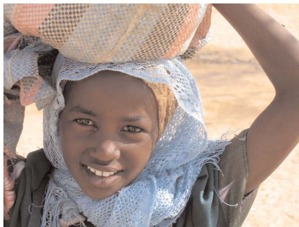
The refugee camps had few visible livelihood projects for adolescents who are not in school. Many teenage girls in the camps had little to do other than domestic chores.

There was very little for teenage girls to do in the camps other than domestic chores. There were no visible livelihood projects and secondary education did not exist. Even if it did, most girls were