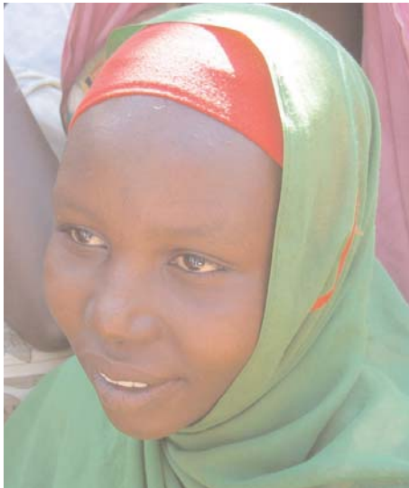
This refugee woman, 19, didn't go to school in Sudan, but says she would like to start in the camp. "We didn't know education was good for us women before we came to the camp. Now we know," she said.

Literacy classes were usually held in the mornings or evenings to accommodate the daily chores and were primarily oriented toward adults. Many of the adolescent married women who could not or did not attend school attended literacy classes. 94 In addition to basic literacy, some of the classes also taught numeracy and Islam. 95 CARE encouraged literacy classes in the camps where it was operational.