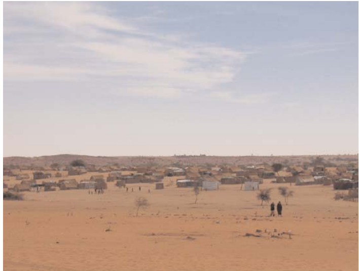
The refugee camps in eastern Chad are in a remote and very poor area of the country, with very little infrastructure and few resources. The camp pictured above is Iridimi.

Periodically, gaps in relief have caused fighting between refugees and the host communities. The inequitable distribution of assistance and the underlying desperation that looms in and around the emergency situation have resulted in reports of theft, exploitation, rape and other offenses. Conducting operations from the regional capital of Abeche, UNHCR has tried to include the local population in its humanitarian planning and budget. Compounding the problem is the fact that a 2002 attempted coup diverted the attention of President Deby and the Chadian Parliament away from the needs of its distant citizens. Across the nation, the weakened rule of law has led to the proliferation of light weapons and increased crime rates. 9