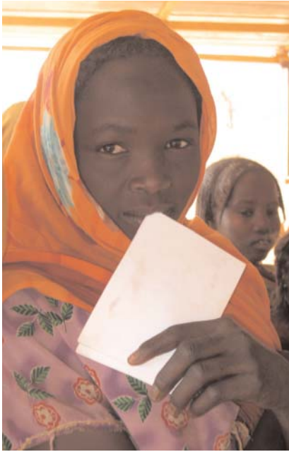
This refugee girl in Djabal refugee camp is waiting for a blanket on distribution day with her registration card.

4,000 and 5,000 “spontaneous” refugees were unregistered; many of these people are living near the border to monitor their livestock. Gendarmes in the Mille camp report that from one to three “spontaneous families” arrive every week. 121