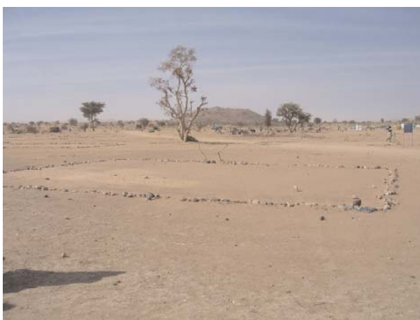
At the time of the Women's Commission's visit, Breidjing refugee camp had no tents for classrooms. The stone outlines pictured above served as "classrooms" for the children.

The Breidjing camp had no tents or structures for classrooms; classes were held inside squares delineated by rocks in the sand. Zadok Lempert of