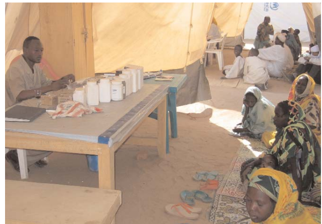
Health education and the importance of pre-and post-natal care are taught in many of the refugee camps.

Health education, including hygiene and cleaning methods, was taught in at least two of the camps, Farchana and Touloum. Teachers were trained and the knowledge was passed to the youth in the classes. The children then brought this information home to their families. Children and youth were taught songs about hygiene and learned to perform musical and dramatic presentations on health and hygiene for the community. 97