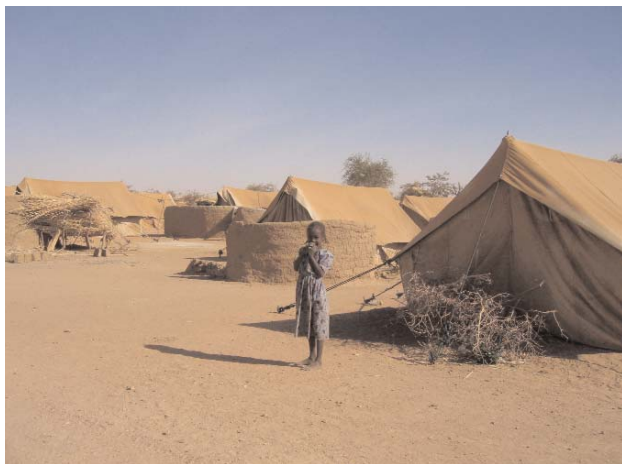
The harsh climate in eastern Chad makes a difficult life for refugees even harder. Water and firewood are scarce and temperatures fluctuate from extreme heat to cold. Sandstorms and heavy rains also present a challenge. This young girl lives in Kounoungo refugee camp.

The 11 refugee camps in eastern Chad lie along almost the entire length of the shared border with Sudan. In the north, around Bahai and Iriba, people have settled in the desert with few trees, a lack of arable land and little water. People in camps in the south of the country, near Goz Beida, fare a bit better than those in the north. They have greater access to water and it is possible to grow crops on small plots. 15