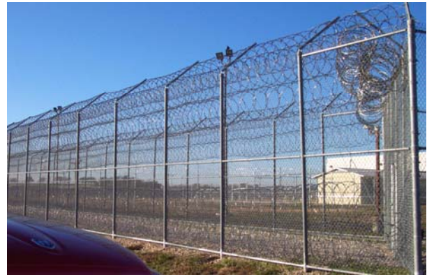
Left, the entrance of the T. Don Hutto Residential Center in Williamson County, Texas. Right, several layers of concertina wire and fencing surround the former prison.

Hutto’s interior layout features a system in which 11 pods, or living units, each with two levels of cells, open into a common area.