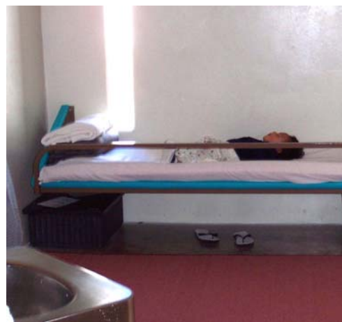
Left, the communal area of a pod. Each pod contains 20 to 30 cells on two levels. Right, a cell with a single twin bed. There is no divider between the sleeping area and the toilet area in the cell, so families are not afforded any privacy when using the toilet.