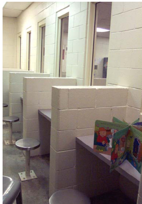
A Plexiglas wall separates detainees from their visitors. Visits are non-contact to eliminate the need for strip searches following a visitation.

The public information officer explained that visits are non-contact to eliminate the need for strip searches following visitation. Dominica, a pregnant asylum seeker detained with her two daughters, summed up the tremendous strain that non-contact visits pose on people who have not seen each other in many years. She explained that while she is happy to finally see her mother again, it is difficult to be forbidden to touch her. 122 In some cases, visitors are U.S. citizens, whose parents, spouse or children were apprehended and detained.