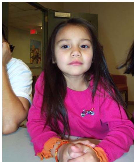
Prior to the opening of Hutto, detained children were separated from their parents and placed in the custody of the ORR Division for Unaccompanied Children’s Services.

Congress discovered this and took immediate action to rectify