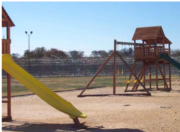
The outdoor play area at Hutto is fenced in by concertina wire. Children said that they had not been outside on the playground in several months.

Children and parents with whom we spoke indicated that they had no significant complaints about the quality of education provided at Berks. One family was released during the time that we were researching this report, and the children now attend public schools in the area. Although they had only been in mainstream school for about a week when we spoke with them, they seemed to be doing well in their classes and performing at grade level. In addition, all three of the children learned to speak English quite well during the time they were at Berks.