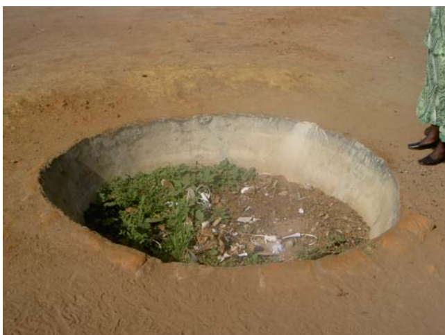
Unfenced medical waste pit, Health Centre II, Omot IDP camp.

The practice of infection control by health workers in health facilities was reported by the MoH and observed to be very poor. In the observed Kitgum health facilities, which were all supported by international NGOs, supplies such as needles, syringes and gloves were available but not in abundance, and health workers expressed concern they would run out of these supplies. Disposal systems such as boxes for sharp materials, incinerators to burn sharps and fenced-off waste pits were established, though in one setting the system had broken. There were autoclaves in the health facilities but not a consistent supply of charcoal or paraffin to use them. In addition, there were no written instructions on how to use the autoclaves.