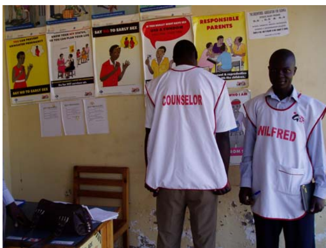
Gulu Youth Center Counselors.

Individual interview with IDP woman, Kitgum District.