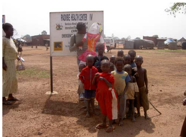
Group of children outside Padibe Health Centre IV.

According to current indicators the level of RH in northern Uganda has fallen dramatically below national averages. A recent United Nations Population Fund (UNFPA) assessment highlights the fact that many of the international NGOs and agencies providing health care in the camps have limited sexual and RH programs. 30 The programs