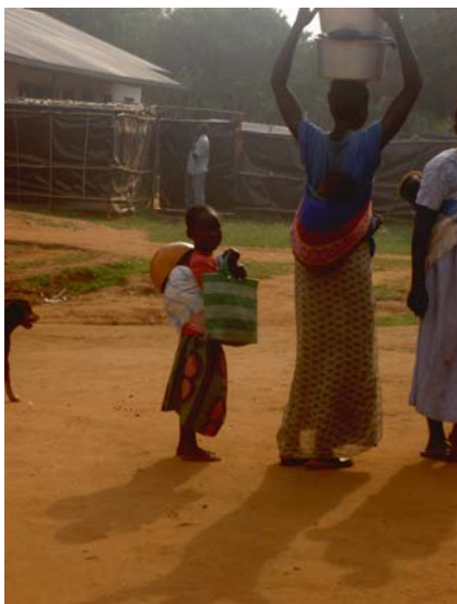
Women returning from the market. Like her elders, the little girl is carrying a small baby on her back, protected from the sun by half a calabash shell, Mucwini camp.

pants wanted access to birth control. Contraceptive methods were available at the health facility in Mucwini camp but women were not aware they were available. Although some women said they still wanted up to six children, they also mentioned that they would have wanted more before the war and that it was too difficult now. Most female focus group participants could identify contraceptive methods such as injection (Depo Provera), pills, condoms and Norplant. The overwhelming majority of focus group participants were not aware of emergency contraception (EC). Some of the female focus group participants had never heard of female condoms while others had and were interested in trying them. Focus group participants said that there was a real need for general sensitization, particularly among married men, on family planning in the camps and suggested going house to house to discuss the issue as very few practice family planning.