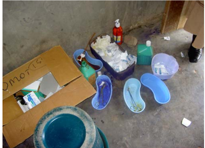
Dressing room at Omot IDP camp HC II. All equipment and instruments are kept and cleaned in kidney dishes on the floor as the room does not have a table.

In one facility the health worker was knowledgeable about how to use the autoclave, yet in another the health worker did not understand the protocol for its use. Adequate water tanks were available in one facility, but not in another. Soap was generally available.