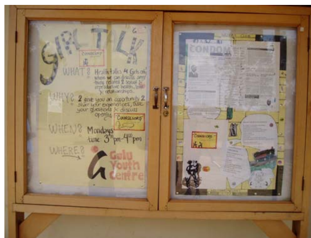
Gulu Youth Center Schedule of current events.

Both male and female adult focus group participants reported that young men and women have sex before they are married. Some said that teenage girls provide sex to men in exchange for food and protection. 76 Many male and female focus group participants said girls have unwanted pregnancies, are forced to leave school and are abandoned by the men. Young girls also attempt unsafe abortions and some have died. 77 78