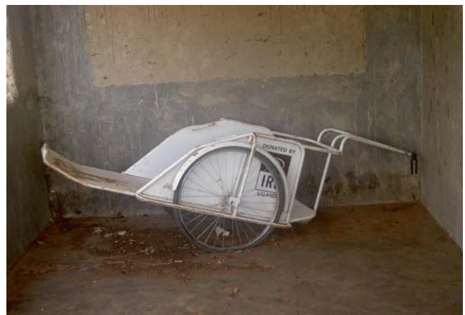
Non-functioning bicycle ambulance: it has a flat tire and the bicycle is gone. It is only used to move dead bodies and supplies. Omot IDP camp, Health Centre II.

Focus group participants in Kitgum and Pader districts report that they transport women from home by bicycle—with a stretcher attached if available—to health facilities. Health workers in Kitgum and Pader districts refer women suffering from complications of pregnancy and delivery to the Kitgum and Patongo hospitals, respectively. In one setting an NGO provided a mobile telephone to the clinic and in another the clinical officer uses his own mobile telephone to call an ambulance. However, the ambulance will not travel to at least one setting at night due to security issues. In addition, in one of two settings, vital medications such as oxytocic drugs to prevent hemorrhage and magnesium sulphate for seizures were not available to stabilize a