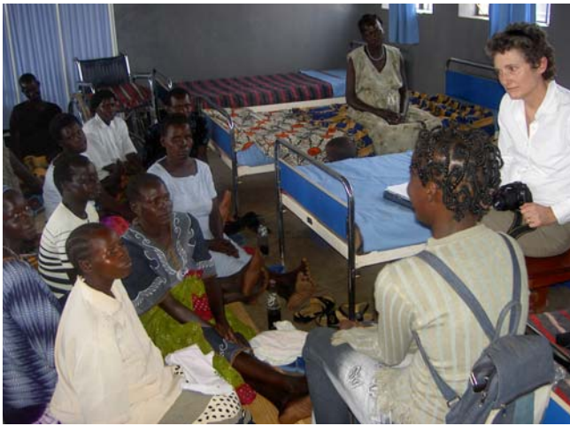
Focus group discussion with Antenatal Care Clients, Padibe Maternity Unit.

Health workers reported that partners of pregnant women do not come for VCT. Men consider that getting tested and dealing with the risks of HIV/AIDS for pregnant women is a woman's problem.