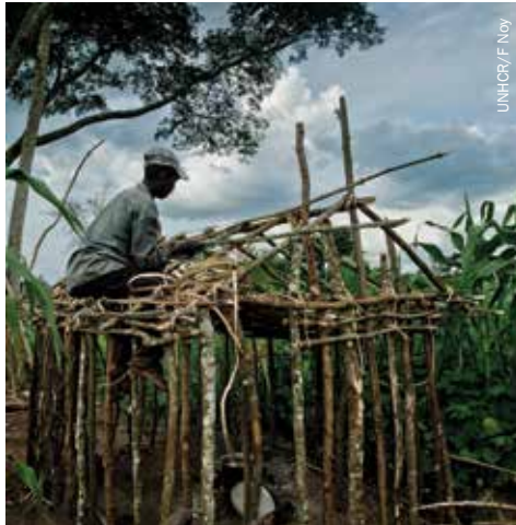
Congolese refugees build new shelters in Rwamwanja, Uganda, following new waves of fighting in North Kivu in 2012.

Especially in post-colonial states it is often the case that there is not a good 'fit' between state borders and the peoples they contain. Even so, there are good reasons not to welcome the eventual collapse of existing states and their rebuilding as new states. First, history teaches us that the drive to create mono-ethnic states has itself been a major cause of forced migrations. Second, the processes of state dissolution and collapse are horrifically disruptive to individuals, both domestically and regionally. Third, seceding states and the remaining 'rumps' are likely to remain very fragile.