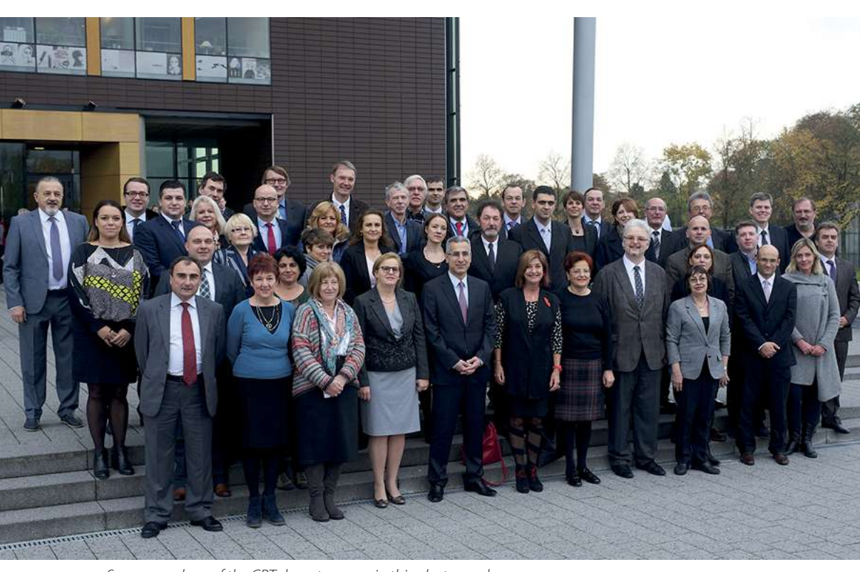
Some members of the CPT do not appear in this photograph.