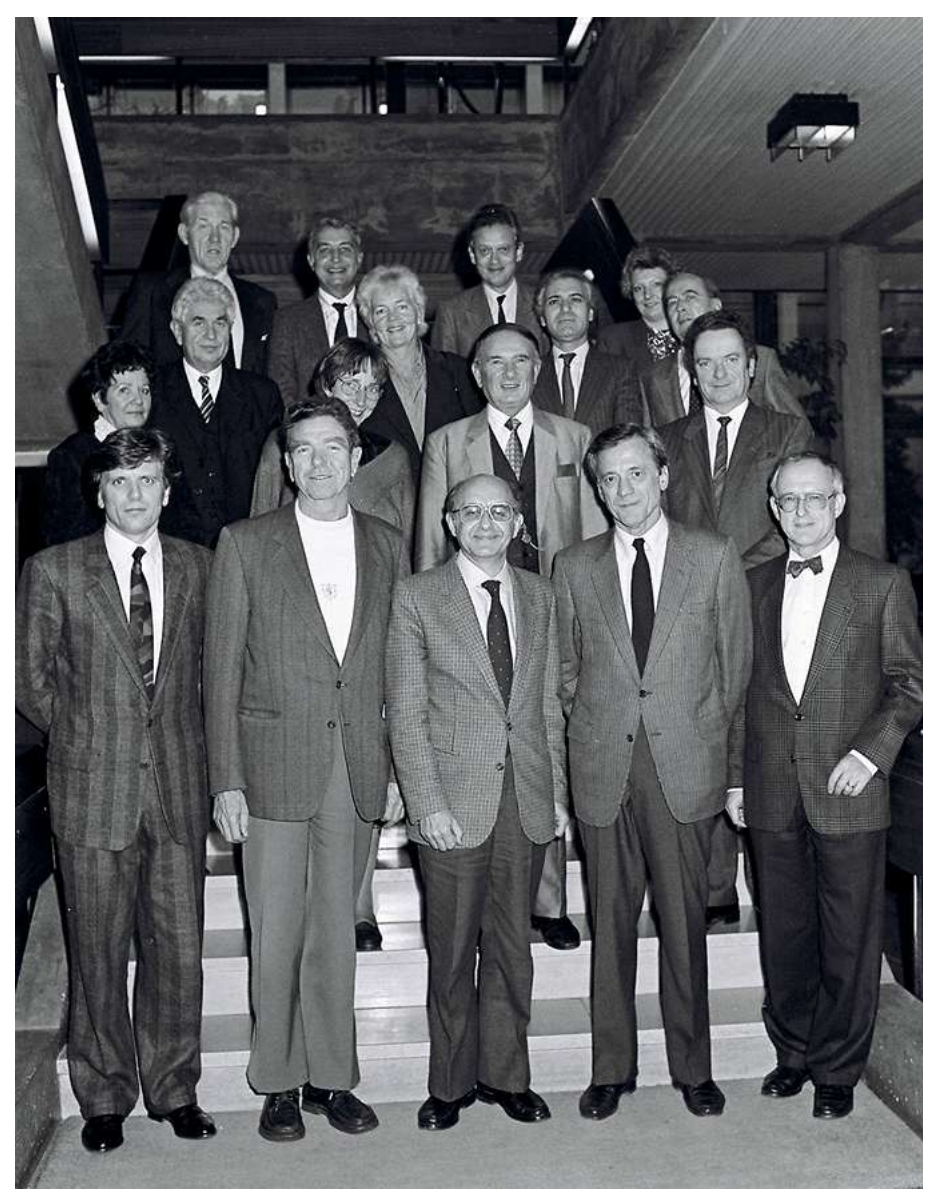
Photograph taken on the occasion of the CPT's first plenary meeting (November 1989)