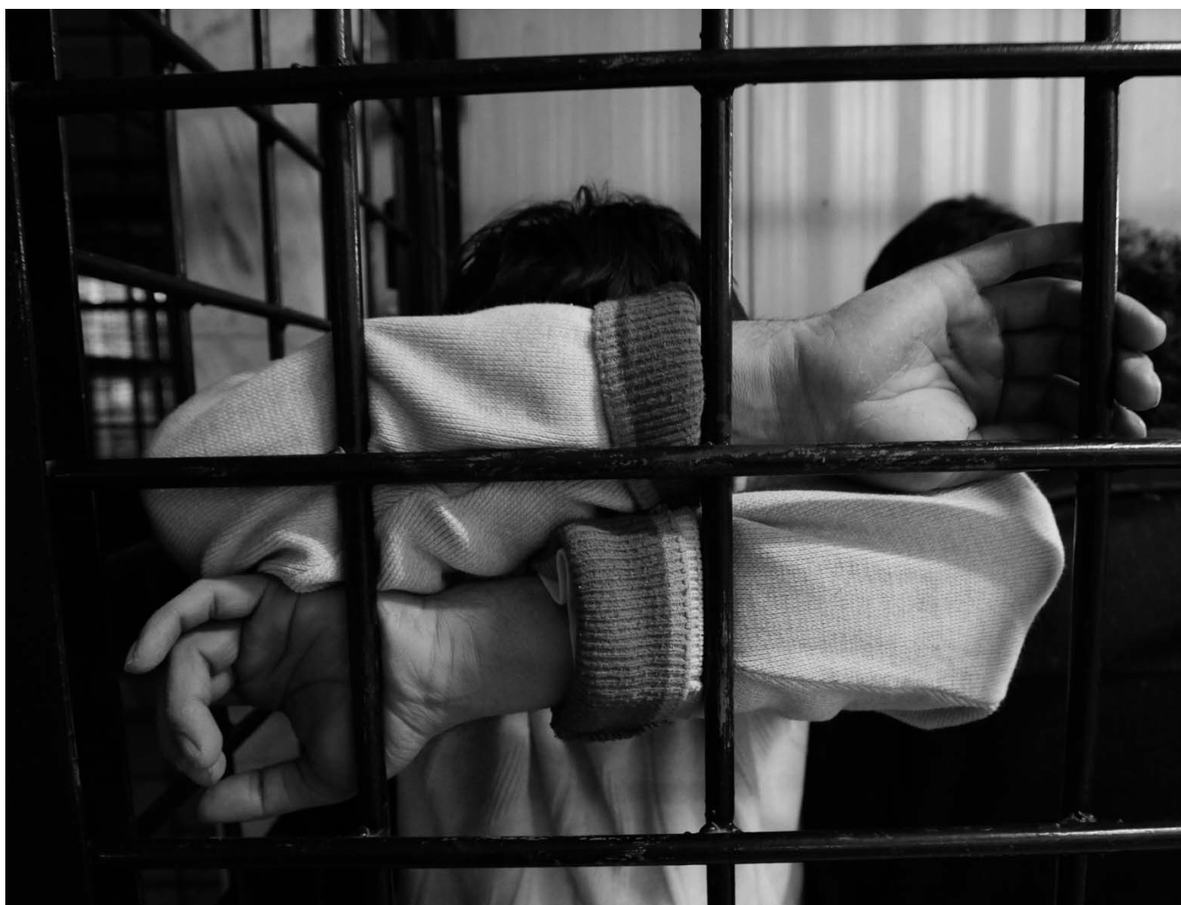
A detained illegal immigrant from a former Soviet republic waits in a holding cell at a police station in Russia's Siberian city of Krasnoyarsk. Ilya Naymushin / Reuters, September 2013.

According to the 2010 census, there are 205,000 Roma in Russia. Their communities are plagued by sub-standard living conditions, difficulties in socio-economic integration and, at times, segregation of children in schools. Both migrant and Roma settlements have been targeted by law-enforcement officials.