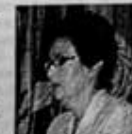
PATRICIA ESPINOSA TORRES, PRESIDENTA DEL INMUJERES.

“Solicitamos que se lleve la investigación hasta sus últimas consecuencias... (se debe) aclarar si los derechos de las mujeres fueron violentados y si fueron violadas.”