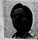
EDUARDO MEDINA MORA, SECRETARIO DE SEGURIDAD PÚBLICA.

“No se tiene ninguna imputación directa de conductas violentas por parte de los policías federales preventivos que participaron en el operativo para restablecer el orden.”