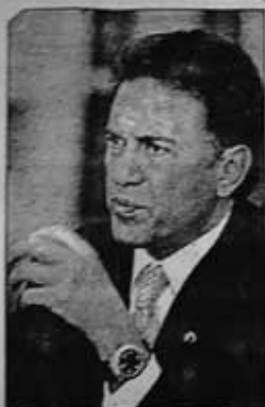
Miguel Ángel Yunes. Imagen de archivo ■ Cristina Rodríguez

La asistencia de Yunes a la Cámara de Diputados servía en esos momentos para responder a la creciente demanda de justicia por los actos de violencia contra los detenidos, y en especial de las mujeres vejadas. La explicación redundó en hacer respetar el multicitado estado de derecho.