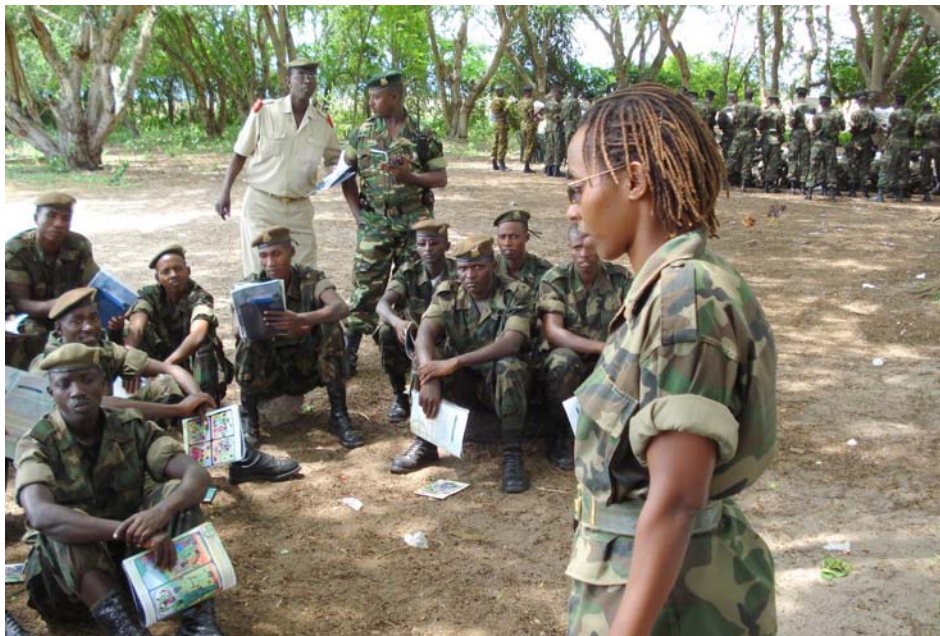
In Burundi, the only female member of the contingent sensitizing her company who were receiving pre-deployment training.

Furthermore, many children (and adults) do not know how to report abuse and the reporting procedures are often unclear particularly in a conflict setting where the legal system may be non-existent or unreliable. Finally, perhaps the biggest obstacle to reporting is a lack of faith that the matter will be dealt with at all and an expectation that the perpetrator will not be punished and that the victim will not receive adequate medical, financial or psychological support.