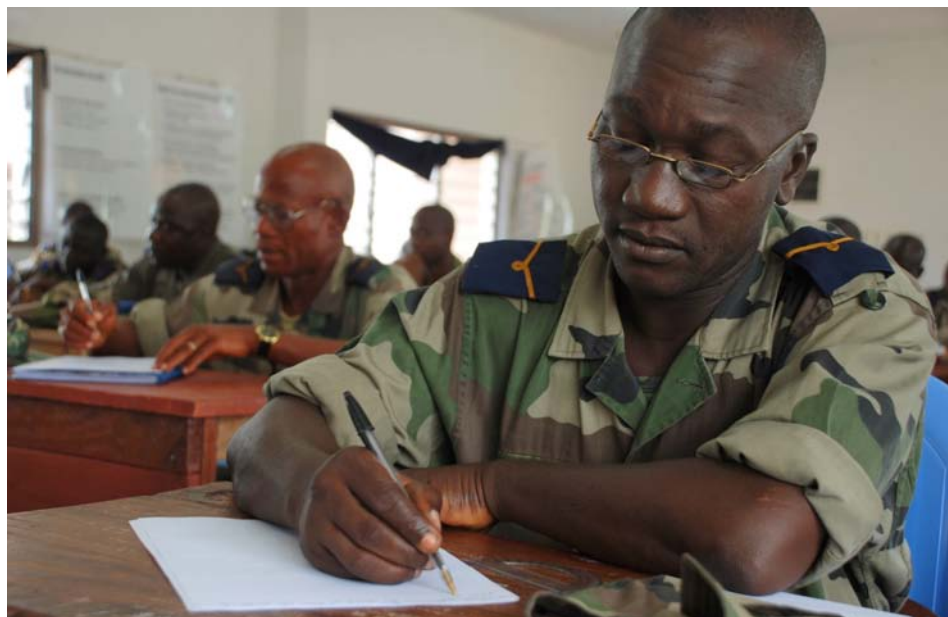
Côte d'Ivoire. Training session with governmental forces.