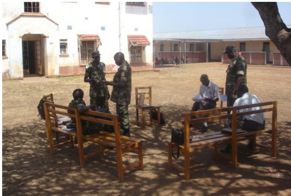
Child Protection Unit in Gulu, Uganda

Many of the military interviewed expressed an interest in having more visual aids available to them to enhance their training such as video footage. At the meeting of military trainers held in Senegal in 2008, they agreed that it was vital to have short, simple and unambiguous messages for soldiers who have had little education but to build in scope for discussion and debate for higher-ranking soldiers.