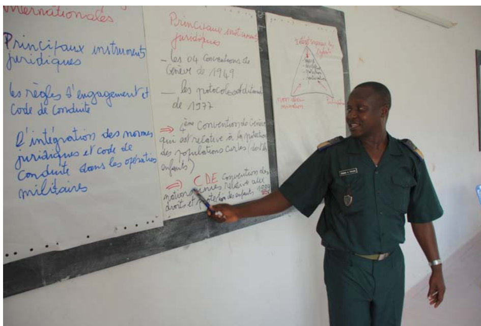
A training session with governmental forces in Côte d'Ivoire - highlighting the difference between children's needs and rights.