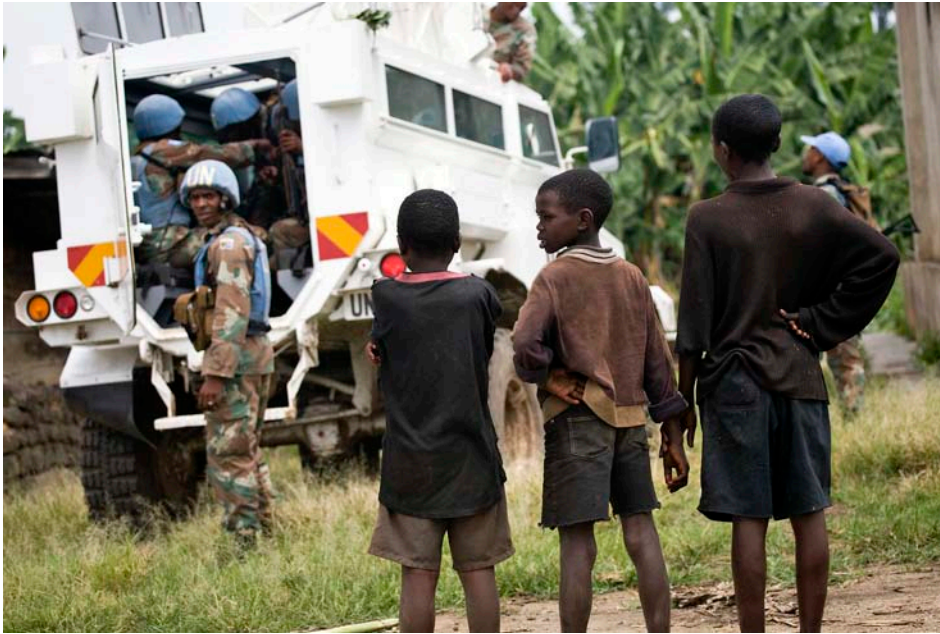
Local population curiously look onto MONUC Peacekeepers (South Africa Contingent, 1 Parachute Battalion) who disembark at SUCP in Ntamugenga, North Kivu, Democratic Republic of the Congo.

A 2008 evaluation of the training program in Uganda describes how the leader of an IDP camp which is located close to a UPDF garrison, found that there has been a dramatic improvement in the perception and treatment of the children by the military since the training on child rights and child protection for the military and for the camp community leaders. In Uganda, there have also been a number of child led dialogues attended by 330 children and 50 UPDF officers. These initiatives offered a forum for confidence building and discussion of issues including sexual exploitation and violence, killings, harassment and unfriendly behaviour by soldiers.