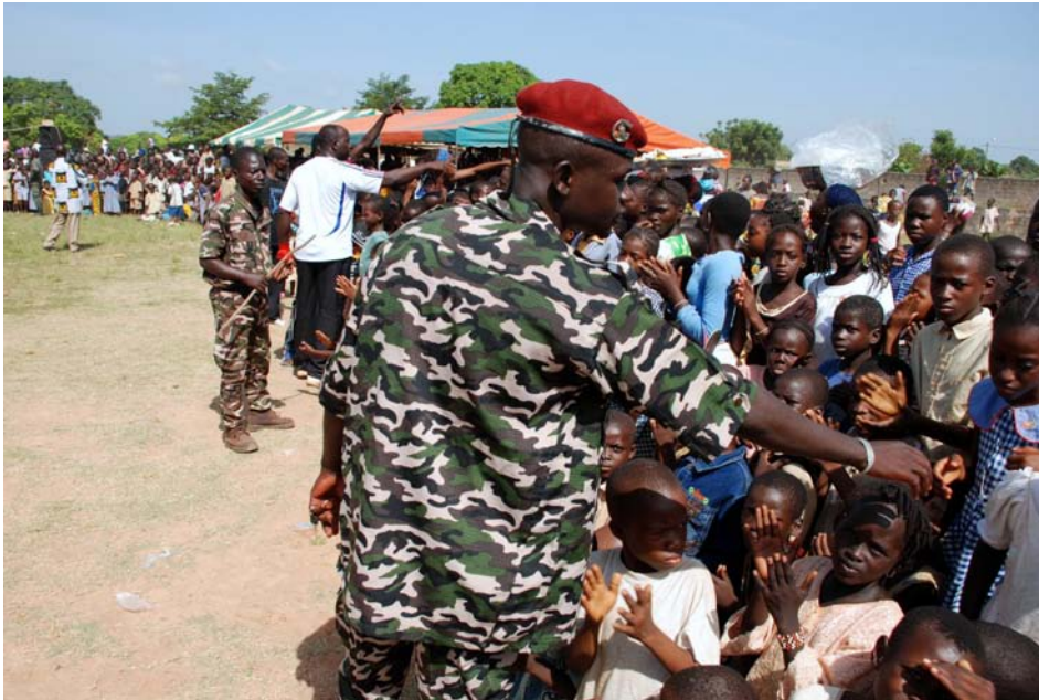
Ferkessedougou, Northern Côte d'Ivoire. Ex-rebels set up their own child protection committee.