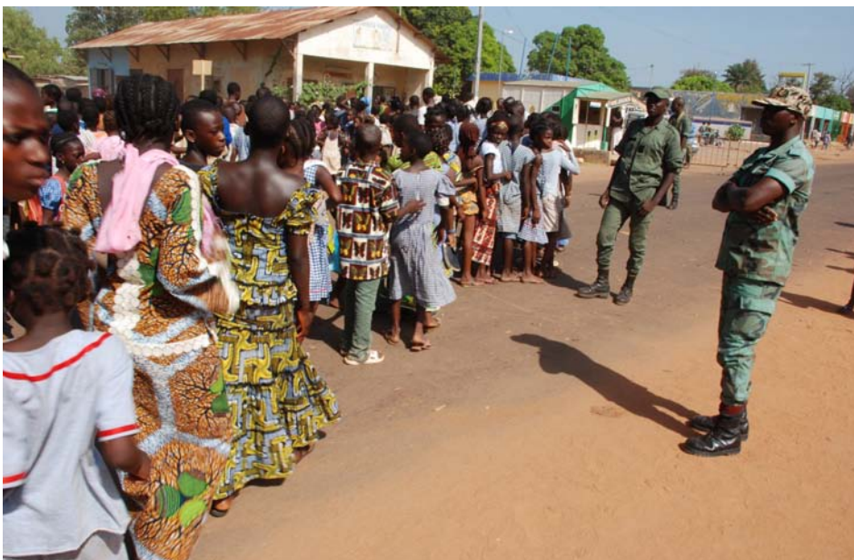
Northern Côte d'Ivoire. Ex-rebels help secure the area for a public event with children in Ferke.