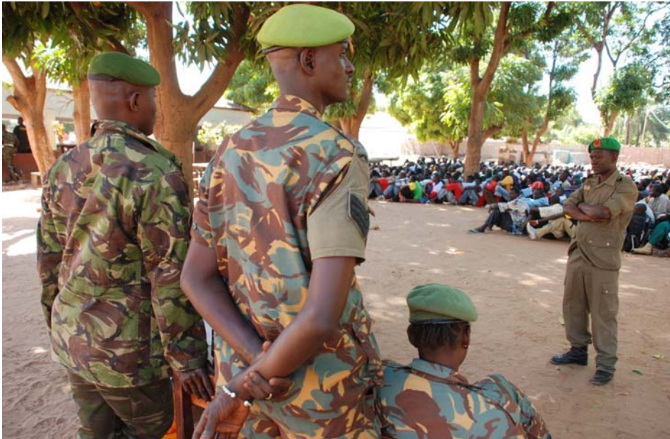
The Gambia. HQ

In addition to these questionnaires, approximately 73 lengthy and in-depth interviews were conducted by Save the Children Sweden's Communication Officers in Côte d'Ivoire, Ethiopia, The Gambia, southern and northern Sudan and Uganda 9 . Those interviewed included senior military from Ministries of Defence, military trainers, low-ranking soldiers who had received the training, other security forces who had been involved in the training such as the navy and fire services, community leaders, partner organisations and former child soldiers. These interviews considered: