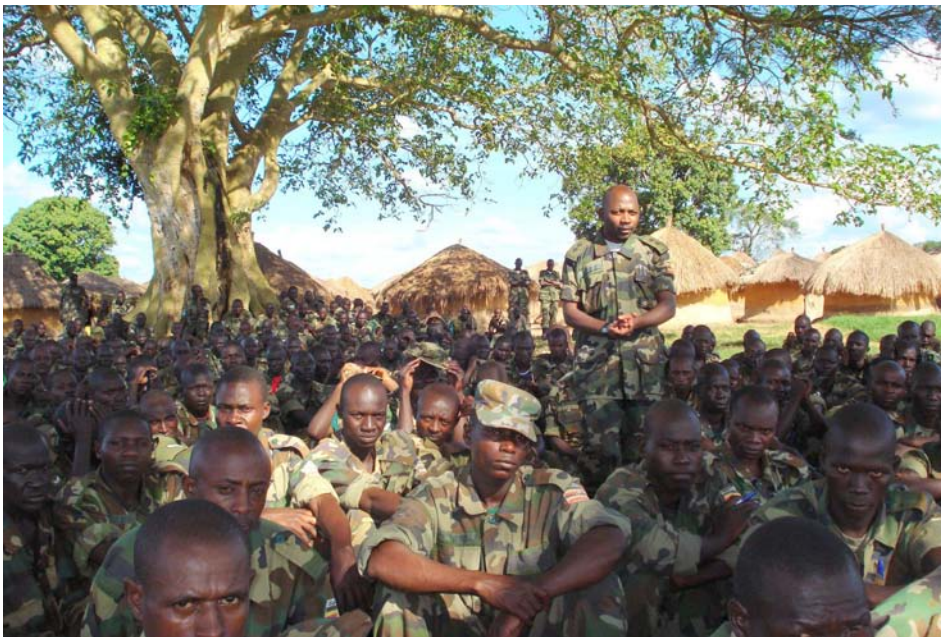
A sensitization session of Uganda troops bound for the African Union Mission in Somalia (AMISOM) peacekeeping mission.