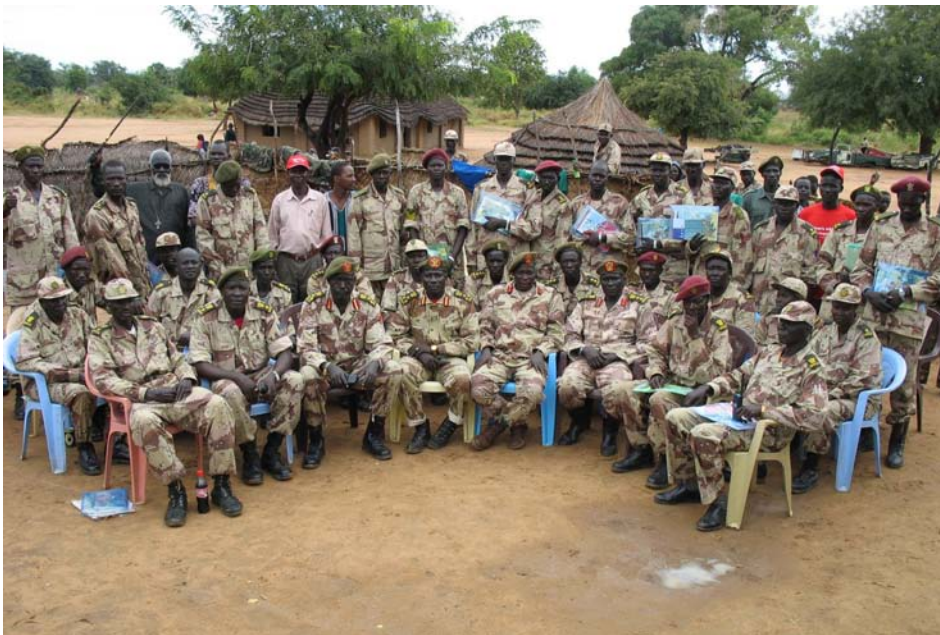
Group photo for the Military officers after the training Northern Bhar el Ghazal, s. Sudan (October,2006).

As soldiers move constantly, it is very difficult to follow up to see how effective the training was. And, even when it is possible to do follow up, the information is collected from the individual who was trained. It is still very difficult to assess the impact of the training on children and communities. It is very hard to know if the training actually contributed to a soldier changing his or her behaviour for the better. It is easier to measure the impact of positive initiatives but difficult to know if the training does indeed lead to more children being protected.