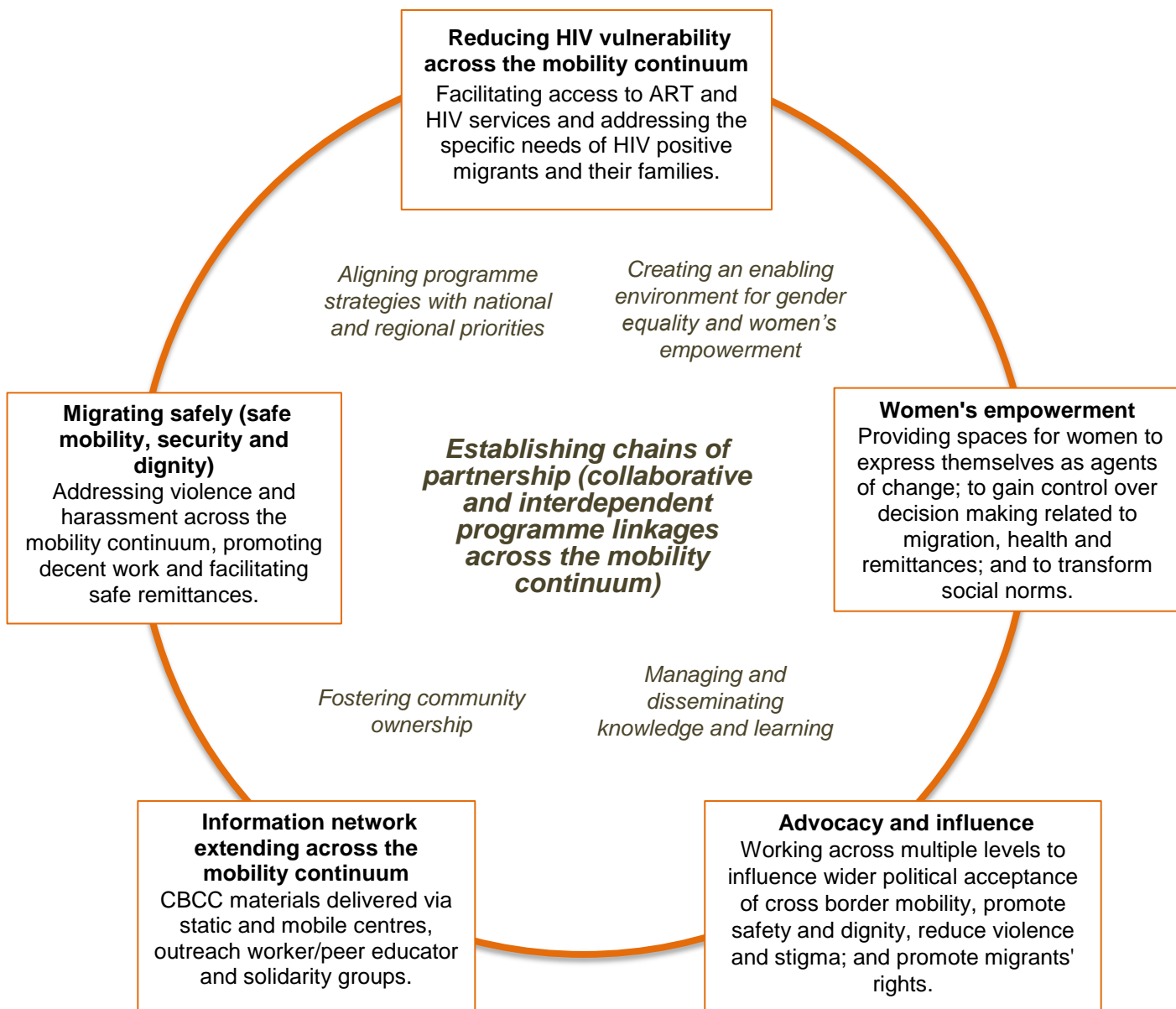
Figure 1: A comprehensive model for working with mobile populations across the mobility continuum