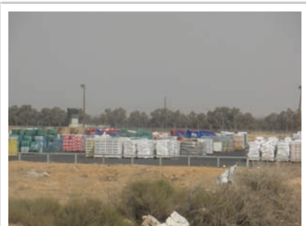
Kerem Shalom Crossing

Partially open for the movement of a number of authorized passengers, Palestinian medical and humanitarian cases.