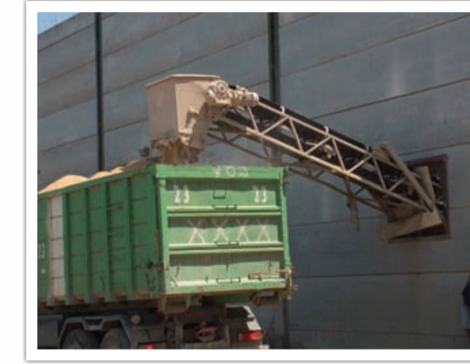
Karni Crossing conveyor belt

Closed since June 11, 2007. External conveyor belt operational, two days a week. Cement lane completely closed since Oct 29, 2008.