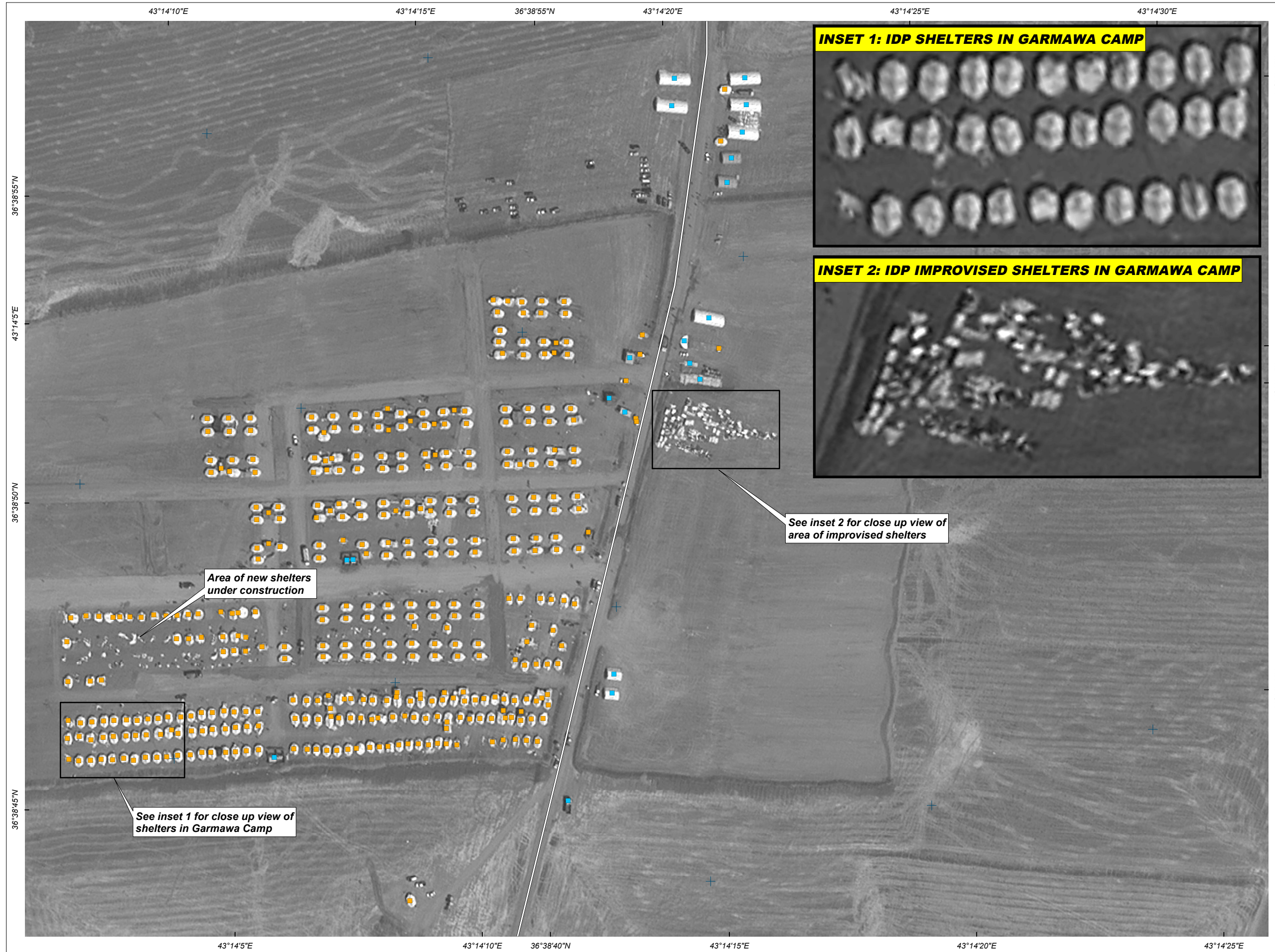
INSET 1: IDP SHELTERS IN GARMAWA CAMP