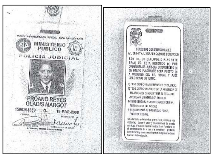
Table 3 Card setting out the rights of arrested persons*

* [Constitutional Rights, art. 24 # 4 and art. 3 of Judicial Police regulations when making an arrest. I am an officer/police officer/agent (name).