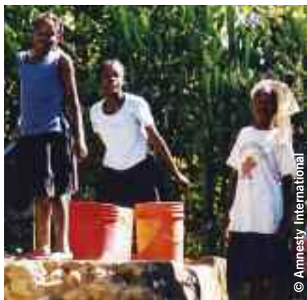
Girls collecting water in North Department, Haiti, 2004.

The Haitian government, with the support of the international community, urgently needs to reinforce protective measures for girls in domestic service and take greater steps to abolish this practice.