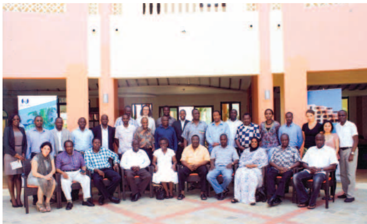
PWGID workshop with PSC on resettlement of IDPs, at Pangoni Beach Resort from 4th - 6th Dec. 2011

Finally, although the policy on internal displacement is based on international standards, it also enhances and elevates the instruments in Kenya. For instance, the enactment of the Bill on internal displacement gives the standards full force of law. The policy itself is specific on the obligation imposed on the State as the primary protector with other actors playing only a supporting role. Moreover, the policies anchor protection of IDPs on a right-based platform thereby confirming that the protection of IDPs is not a mere political venture but a human rights issue.