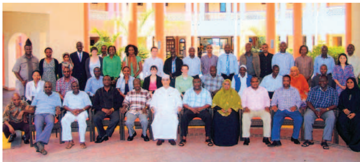
PWGID Workshop with Members of the LSWC on 31 st July, 2012

Finally, referring to the original terms of reference and principles of engagement prepared for the Working Group, it failed to provide effective legal aid to support IDPs in their engagements with the International Criminal Court and the Truth, Justice and Reconciliation Commission; the purchase and registration of land and other immovable property; the facilitation of pro-bono representation of IDPs in matters requiring legal and/or judicial intervention; the institution of class action or test cases on behalf of IDPs, among others. Most of these were done by other networks such as the Kenya Transitional Justice Network, Kenyans for Truth with Peace and Justice (KTPJ) and the Land Sector Non-State Actors (LSNSA). This could be attributed to the failure by the working group to monitor and evaluate its plans of action and partner with like-minded organisations and networks to extend its reach. Moreover, attempts to incorporate organisations working with special needs groups within the displaced population such as women, children, persons living with disabilities, the elderly, and persons living with HIV/AIDS were limited. 67