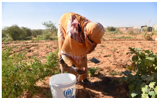
Refugee woman working in her garden nearby Mbera camp

Refugees in Mbera camp are dependent on food assistance due to very scarce local resources. UNHCR works with partners to improve access to gardening fields and livestock to reduce refugees' dependency on food assistance. Development interventions are needed in the Hodh Echargui region to help both refugee and host communities become more resilient.