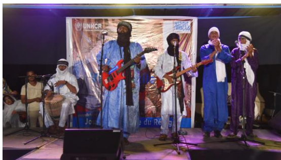
The Taflist, a refugee band from Mbera camp, performing in Noakchott during the celebrations for the Word Refugee Day.

On the occasion of World Refugee Day, UNHCR Mauritania held commemorations in Mbera camp and in the cities of Nouakchott and Nouadhibou. On 18 June, UNHCR, in collaboration with the French Institute in Mauritania, held its kick-off event for World Refugee Day in Nouakchott with a movie-debate . On 20 June, UNHCR and its local partner ALPD organized a series of community activities in Nouakchott and Nouadhibou, and a Malian refugee band performed in the evening at the French Institute of Nouakchott. On the same day, UNHCR in Bassikounou commemorated World Refugee Day in Mbera camp. The closing event was hosted by the University of Nouakchott where UNHCR organized a movie projection followed by a debate with students at the Faculty of Law and Economics.