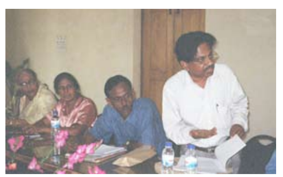
Minority rights activists meeting with the Commission delegation

Ahmadis, and other minorities and has threatened to undermine the democratic institutions that protect religious freedom and to silence the country's voices of tolerance and moderation. That violence escalated in 2005, reaching its height in August when 459 bombs exploded throughout the country on a single day in a demonstration of the militants' operational reach and organizational capabilities.3 The country's courts and secular legal system have been subjected to terrorist attacks by those wishing to impose Islamic law. These attacks have included suicide bombings, a new phenomenon in Bangladesh. Secular NGOs, anti-extremist journalists,