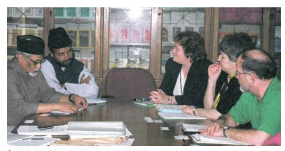
Commission delegation meeting with Ahmadi community leaders

Although the government of Bangladesh has thus far been unwilling to succumb to pressure to declare Ahmadis to be non-Muslims, in January 2004, it bent to militant demands and banned the publication and distribution of Ahmadi religious literature. Police have since seized Ahmadi publications on a few occasions. The ban was stayed by the courts in December 2004, and the government has not appealed the ruling. Although the ban is not currently being enforced, neither has it been withdrawn by the government. Ahmadi representatives have credited U.S. and other international pressure, rather than the guarantees enshrined in Bangladesh's own constitution, for dissuading the government from further restricting their religious freedom.