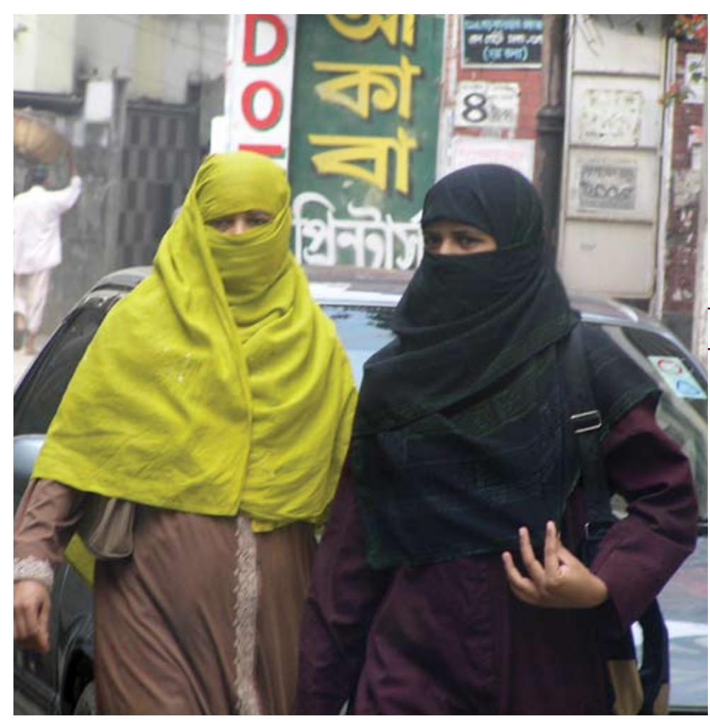
Wearing hijab, rather than the traditional sari, is increasingly common among Muslim women in Bangladesh

Arabic text, see "Jihad Against Jews and Crusaders: World Islamic Front Statement," February 23, 1998 (http://www.fas.org/irp/world/para/docs/980223-fatwa.htm, accessed July 20, 2006).