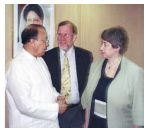
Commissioners Michael Cromartie and Felice D. Gaer meeting with Foreign Minister M. Morshed Khan, with photograph of Prime Minister Khaleda Zia in background

After an initial coolness created by U.S. support for Pakistan during Bangladesh's war for independence, the United States and Bangladesh have developed a good bilateral relationship over the past three decades. The United States became a major aid donor and a reliable source of relief during Bangladesh's recurrent natural disasters. U.S. economic assistance, food aid, and disaster relief have totaled over $5 billion since 1971. According to the U.S. Agency for International Development, U.S. assistance objectives for Bangladesh include stabilizing population growth, improving public health, encouraging broad-based economic growth, and building democracy.13 Both the previous Awami League government and the current BNP-led government have publicly supported the United States in its post-9/11 conflict with Al-Qaeda.14