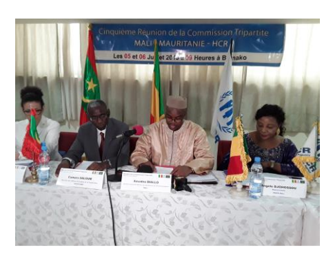
The Tripartite Commission Mali-Mauritania-UNHCR meeting in Bamako

During the reporting period, UNHCR and IOM organized a joint training in Nouadhibou in order to enhance the border police and gendarmerie (air, sea and land border) skills in terms of international protection in a mixed migration context. The two-day training targeted 25 officials. A strong focus was put on clarifying basic