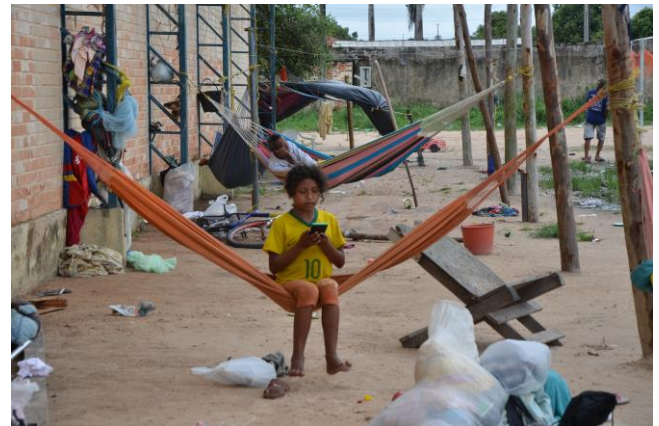
Venezuelans rest outside the shelter in the Boa Vista border city in Roraima state, Brazil. The indigenous Warao prefer sleeping in hammocks, so some have set up their spaces outside the shelter's walls. UNHCR has been working with authorities and partners to establish better living conditions, including access to clean water and medical services.