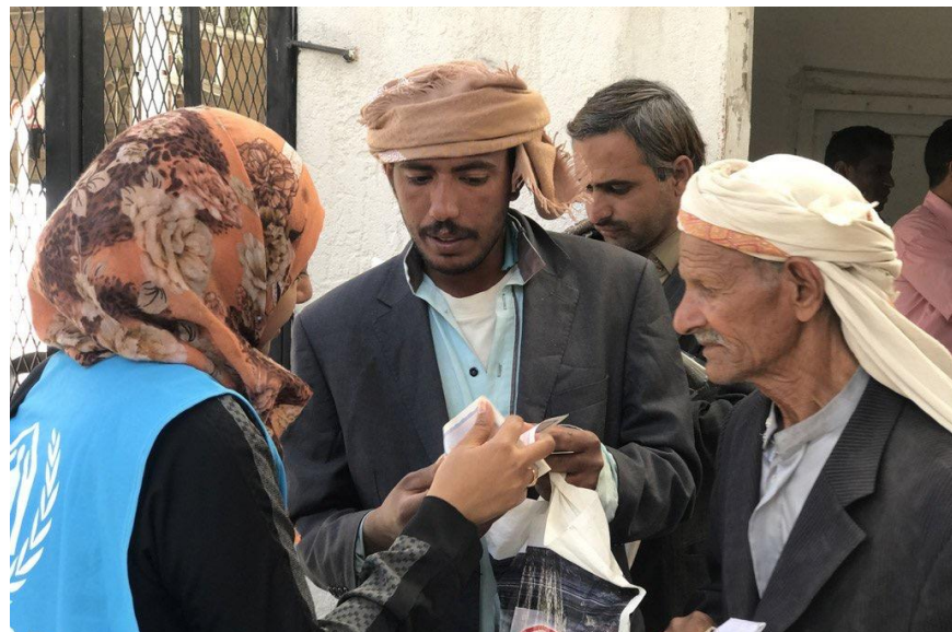
The numbers of IDPs and refugees approaching UNHCR-supported community centres in need of assistance doubled this week.

At least 375 refugees, who were hoping to return home to Somalia, supported by UNHCR and IOM through an Assisted Spontaneous Return programme, remain in Yemen, as three boat departures from the Port of Aden to Berbera in Somalia were postponed due to the closure of Yemen's sea ports. Furthermore, border closures are also impacting aid deliveries. New stocks of UNHCR emergency assistance destined for close to 140,000 IDPs have been halted. Together with the humanitarian community in Yemen, UNHCR is advocating for the border closures to be lifted without delay, as closures are posing a critical threat to the millions already struggling to survive.