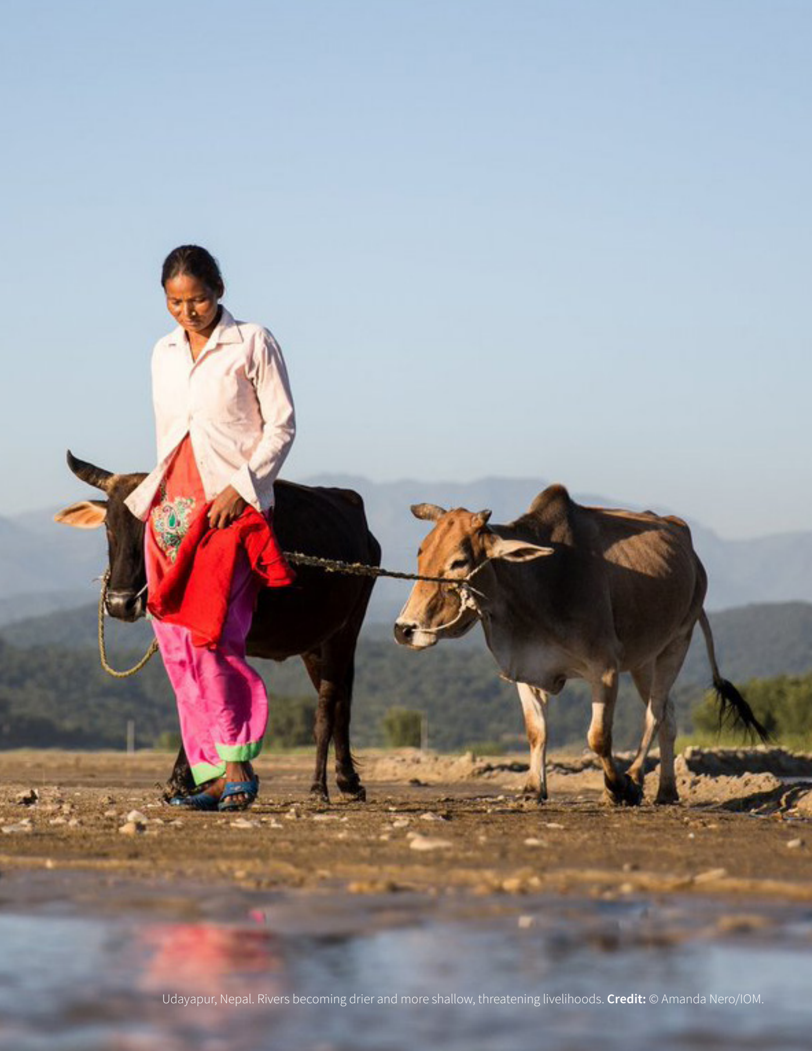
Udayapur, Nepal. Rivers becoming drier and more shallow, threatening livelihoods.