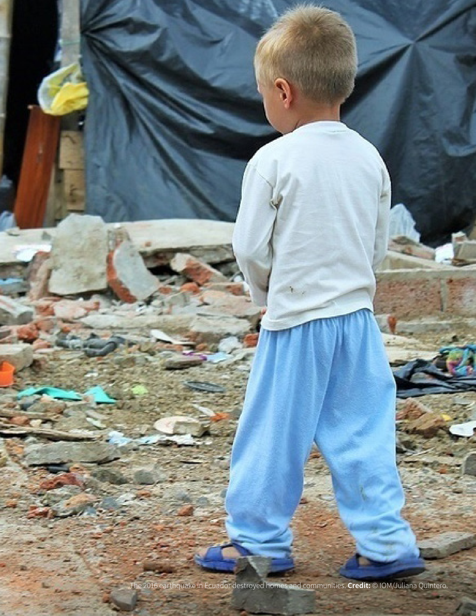
The 2016 earthquake in Ecuador destroyed homes and communities.