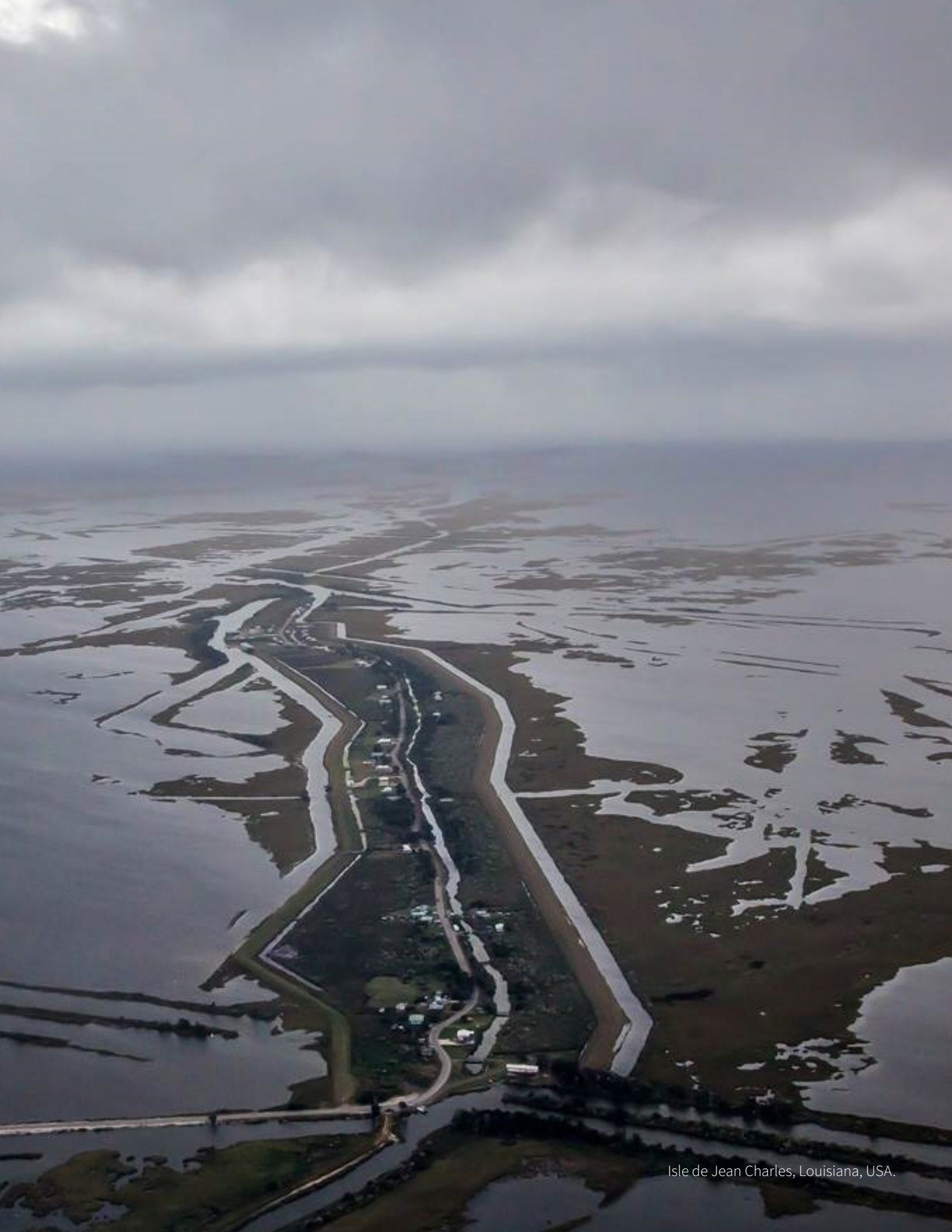
Isle de Jean Charles, Louisiana, USA.