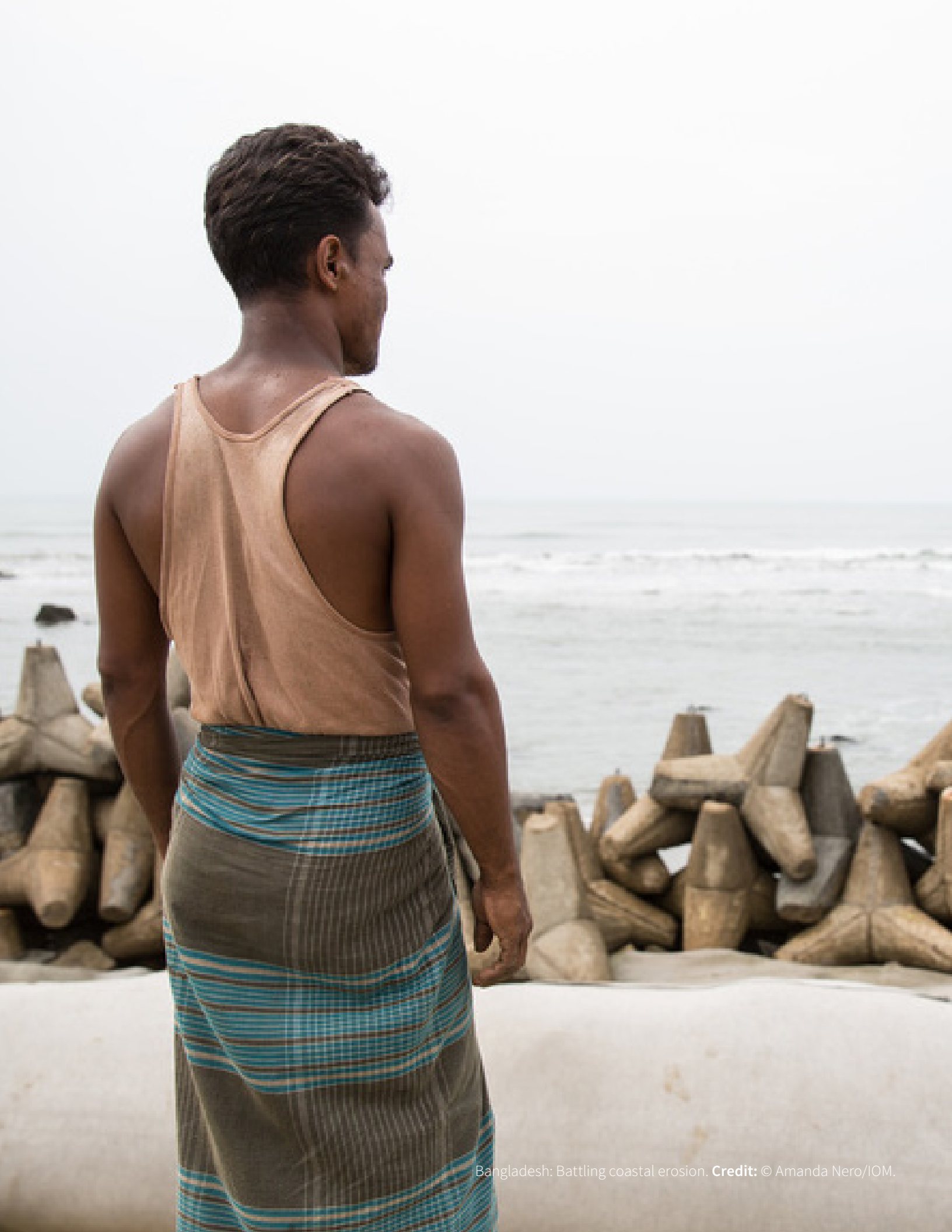
Bangladesh: Battling coastal erosion.