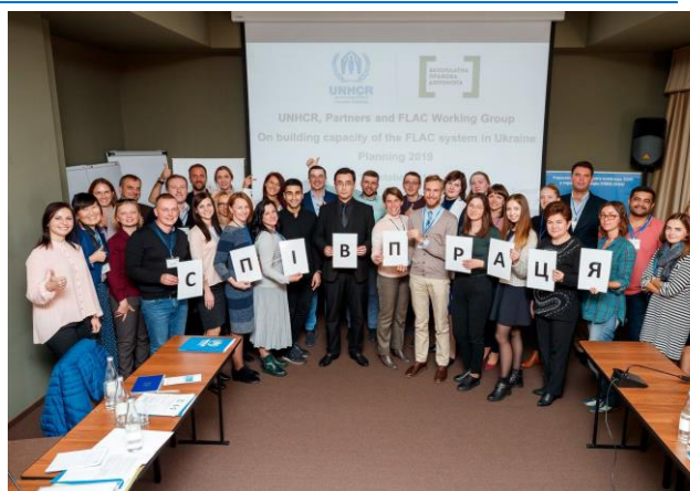
On 12 October, UNHCR met with partners (NRC, R2P, the Tenth of April, NEEKA) and Free Legal Aid Centers (FLAC) representatives from Kyiv and other regional offices. The participants discussed lessons learned from cooperation in 2018 and jointly worked on a plan for capacity building of FLAC and improving legal assistance in 2019. The highlight of the meeting was the signing of a Memorandum of Understanding between UNHCR and the FLAC system.

* Including indicative allocation of softly earmarked and unearmarked contributions.