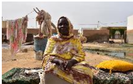
An Ivorian refugee woman sits outside her shelter in Nouakchott outskirts.

In October, UNHCR and WFP presented the results of the socio-economic profiling conducted in Mbera camp in late 2017 carried out by ACF. This study was conducted with financial support from the European Union (EU Emergency Trust Fund for Africa). Among the main outcomes, the study showed that more than 41% of households in Mbera camp are extremely poor and 60% of households do not send their children to school . The study was conducted under Household Economic Approach (HEA) methodology, however UNHCR and WFP came to the conclusion that HEA methodology could not be used as the basis for definitive analysis for household profiling and targeting of assistance in 2019 and beyond. Currently, the two UN Agencies are reviewing the results of the study complementing the analysis with the so-called "refined" Consolidated Approach to Reporting Indicators of Food Security (CARI) approach, which combines several indicators to determine the level of household vulnerability, and UNHCR vulnerability approach .