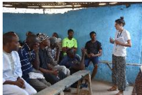
UNHCR protection staff during the meeting with the Sierra Leone community in Nouakchott

There is a considerable number of refugees in need for resettlement in Mauritania. UNHCR continues to identify persons in need of resettlement and conducts advocacy with the support of the Regional Bureau to process cases.