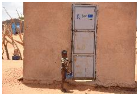
A children in front of one of the 2,193 latrines in Mbera camp

During the month of October, UNHCR continued with routine monitoring and network management activities to make the water system in Mbera camp more efficient . These maintenance works included the change of 42 taps in all areas, the repair of 14 taps, the replace of 14 valve to reduce water loss, the clogging of 9 leaks, and the maintenance of meters. In addition to this, UNHCR continues with the construction of the new 300m 3 water tower .