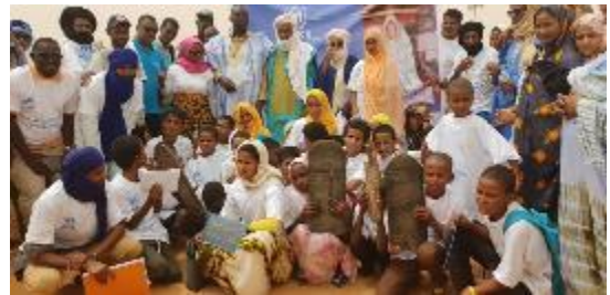
One of the outreach activities of the back-to-school campaign aimed at sensitize Koranic masters and their students

In October, UNHCR also selected 17 qualified Malian refugees for DAFI tertiary education scholarships for the academic year 2018-2019. In urban areas, UNCHR also supports 19 refugees enrolled in tertiary education.