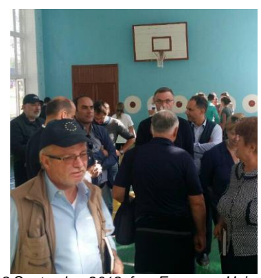
On 18 September 2018, four European Union Members of Parliaments from the Committee on Foreign Affairs led by the chair of the Security and Defence Subcommittee of the European Parliament, Ms. Anna Fotyga (ECR, PL) visited a UNHCR quick impact project in Talakivka (Mariupol area) and UNHCR interventions in EECP Maiorsk.