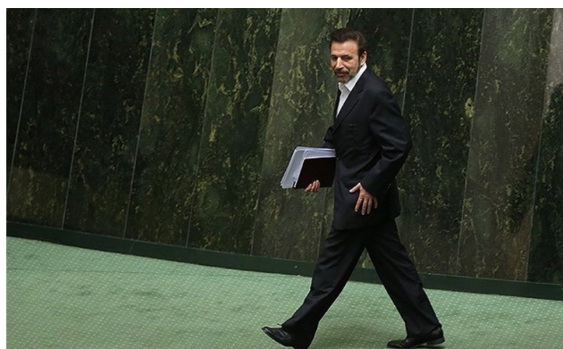
Image of Minister of ICT, Mahmoud Vaezi walking to the podium to inform the parliament of his Ministry's work over the past three years.

The ICT Minister did not explain why widespread censorship has continued in Iran, nor did he indicate which platforms are being targeted for what he described as "intelligent refinement". The Minister has previously referred to a presumably similar process of "intelligent filtering," which was only known to have been deployed on Instagram. The technical problems, as well as the concerns for freedom of expression with this kind of 'intelligent' censorship were discussed in the last "Tightening the Net" briefing 13 .