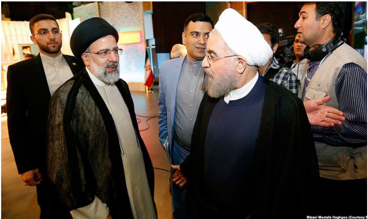
The President Hassan Rouhani met his rival conservative candidate Ebrahim Raisi backstage during the first Presidential debate.

We explore developments in access to information, especially the welcome lack of information controls during the elections; statements from the administration and the Supreme Leader about Internet freedom after Rouhani's victory; developments on the National Information Network (NIN) and net neutrality; and finally the arrests and intimidation of Telegram users.