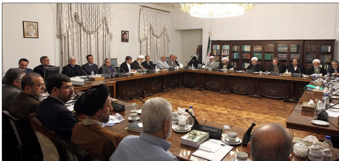
Image of May Meeting of the Supreme Council of the Cultural Revolution

A week prior to the election, during the 8 May 2017 'specialist council' of the 70th meeting of the Supreme Council of the Cultural Revolution (SCCR), a member of the Supreme Council of Cyberspace (SCC) was recorded discussing the development of "cultural guidance for mobile operators", including the opportunities and threats the availability of features such as video calls have brought. It is unclear whether the SCC's "culture guidance for mobile operators" will pass into law, but if the SCCR passes such a directive as a bill, the judiciary will have no other choice but to implement it as a law 6 . It is clear the purpose of such guidance is to have further control over freedom of expression and access to information on mobile connectivity. This is especially significant given that over half the number of Iranians connecting to the Internet do so over their mobile phones 7 .