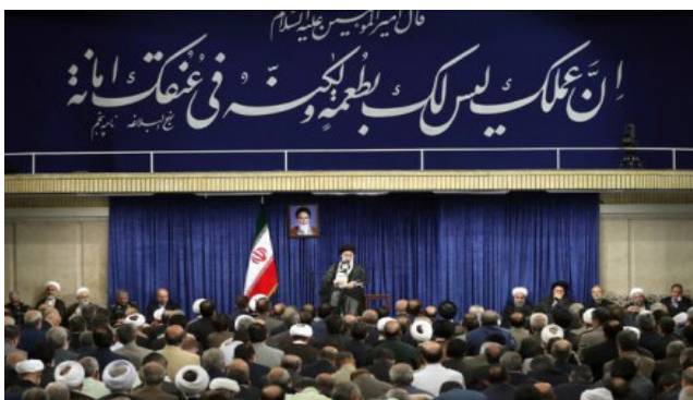
The Supreme Leader Ayatollah Khamenei during a 11 June speech.

While Rouhani and his Minister of ICT differed on the presentation of their Internet agenda, the Supreme Leader Ayatollah Khamenei held an altogether different stance on the track record of this administration. During a post-election 11 June speech to all the heads and leaders of the Islamic Republic's various institutions, including the President Hassan Rouhani, Khamenei criticized the shortcomings of the Rouhani administration in their Internet policy.