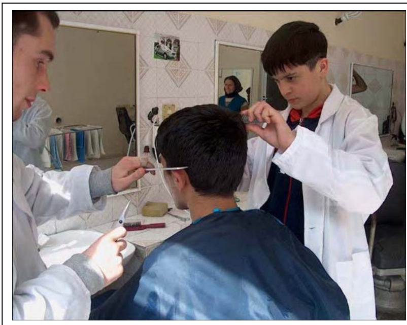
Vocational courses for IDPs: Apprenticeship with a hairdresser

As a matter of State policy, IDPs have equal access to higher education and vocational training programmes as other citizens and are eligible to attend State Universities free of charge if they pass entrance examinations. However, due to the high poverty rate among IDPs, not all IDP youth are able to attend higher educational institutions if it means moving to large urban centers such as Baku.