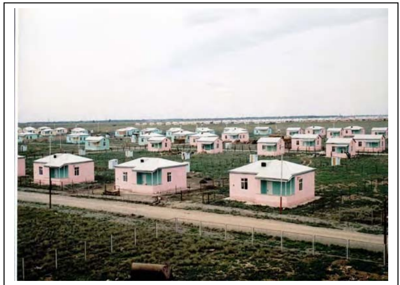
New IDP settlement built by the Government in Fuzuli District

The Government of Azerbaijan has made considerable efforts to achieve the above-mentioned objectives of the 2004 State Programme, in particular in the infrastructure sector by eliminating all tent camps by the end of 2007. So far, the Government has constructed 57 settlements with a total of 16,790 houses for 75,500 IDPs, and infrastructure such as electricity and water supplies. 8 . Increased focus still has to be given to generating employment opportunities and income generation or skills training.