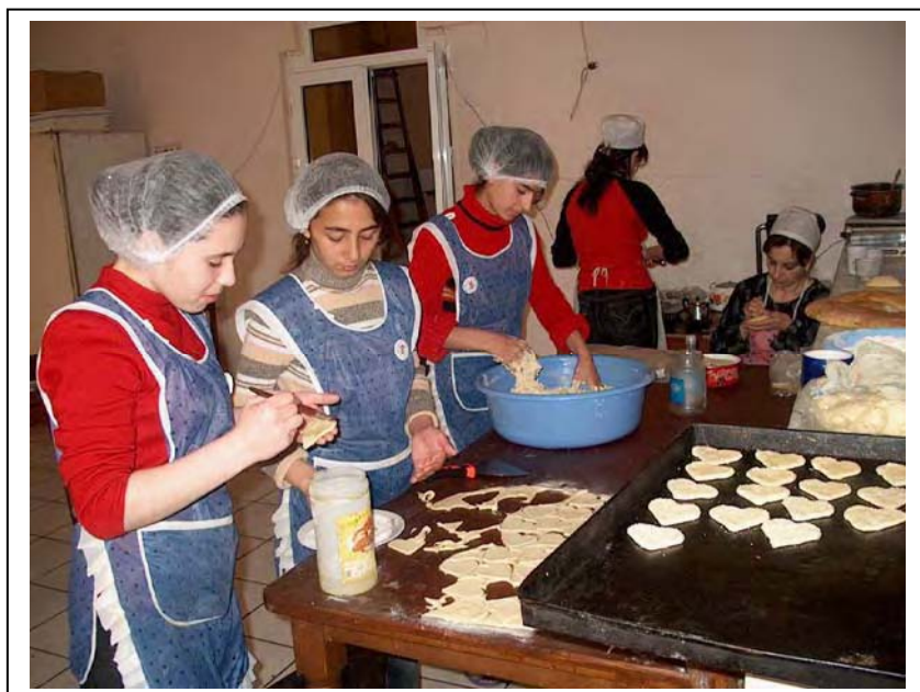
Vocational courses for IDPs: Apprenticeship at a Bakery

IDPs have benefited from a wide range of government programmes and projects of the international community designed to generate self-reliant activity, since their displacement at the beginning of the 1990s. Such projects are ongoing or have been completed by UNHCR, NRC, DRC, FAO, UNIFEM and UNICEF in cooperation with various national actors such as UMID, HAYAT, World Vision and credit agencies. They have targeted men and women equally.