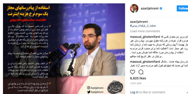
Figure 2: On his Instagram account, Jahromi declares that if users use local state-approved messaging applications, they will receive a 30% discount on their Internet bills.

For now, Minister Jahromi’s strategy to successfully draw users to these platforms seems to be a continued violation of the norms of net neutrality. 11 He announced on his Instagram account on 13 November that users who subscribed to local, state-approved, messaging applications would receive a 30% discount on their Internet bills (see Figure 2). 12