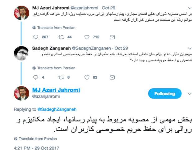
Figure 1: Jahromi responds to a technology journalist’s query of how he expects Iranian users to trust Iranian messaging applications when the government is known to violate and make demands from local platforms.

For now, Minister Jahromi’s strategy to successfully draw users to these platforms seems to be a continued violation of the norms of net neutrality. 11 He announced on his Instagram account on 13 November that users who subscribed to local, state-approved, messaging applications would receive a 30% discount on their Internet bills (see Figure 2). 12