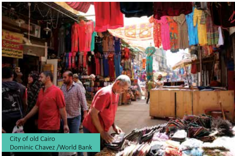
City of old Cairo

As calls for reform increased, the Egyptian President announced in 2003 that steps would be taken to address gender inequality in the law. A committee with representation from all relevant ministries was then formed by the Minister of Justice to consider this issue.