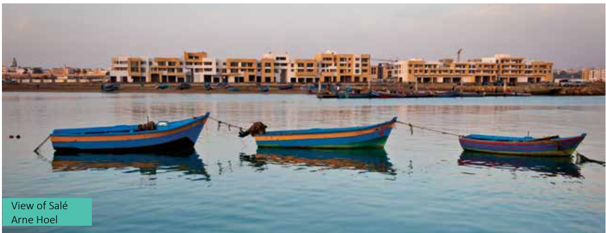
View of Salé