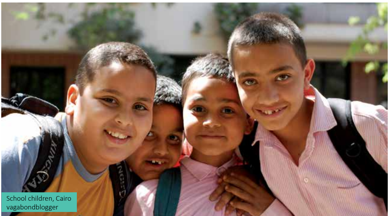
School children, Cairo vagabondblogger

SDGs 1 (No poverty), 2 (Zero Hunger), 3 (Good Health and Well-Being), 4 (Quality Education), 8 (Decent Work and Economic Growth), and 11 (Sustainable Cities and Communities) are directly enhanced by equal nationality rights, which allow both men and women to acquire, retain, change, or confer their nationality. To achieve these goals, the full participation of every member of society is essential. Allowing children to acquire their mother's nationality, and men to acquire their spouse's nationality would include them to access opportunities in work, education, housing, and healthcare.