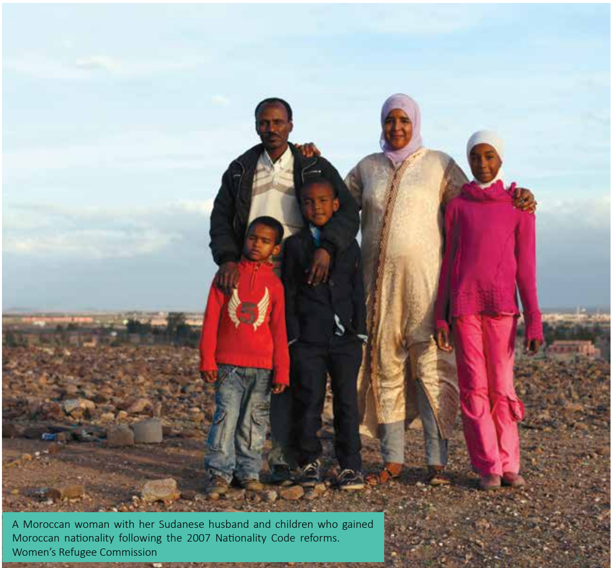
A Moroccan woman with her Sudanese husband and children who gained Moroccan nationality following the 2007 Nationality Code reforms.