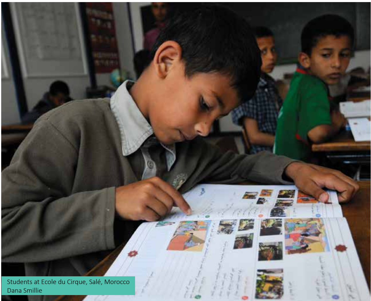
Students at Ecole du Cirque, Salé, Morocco Dana Smillie

Now, these children can benefit from all of the educational opportunities available to citizens, allowing them to more fully contribute to their societies as adults and realize their dreams.