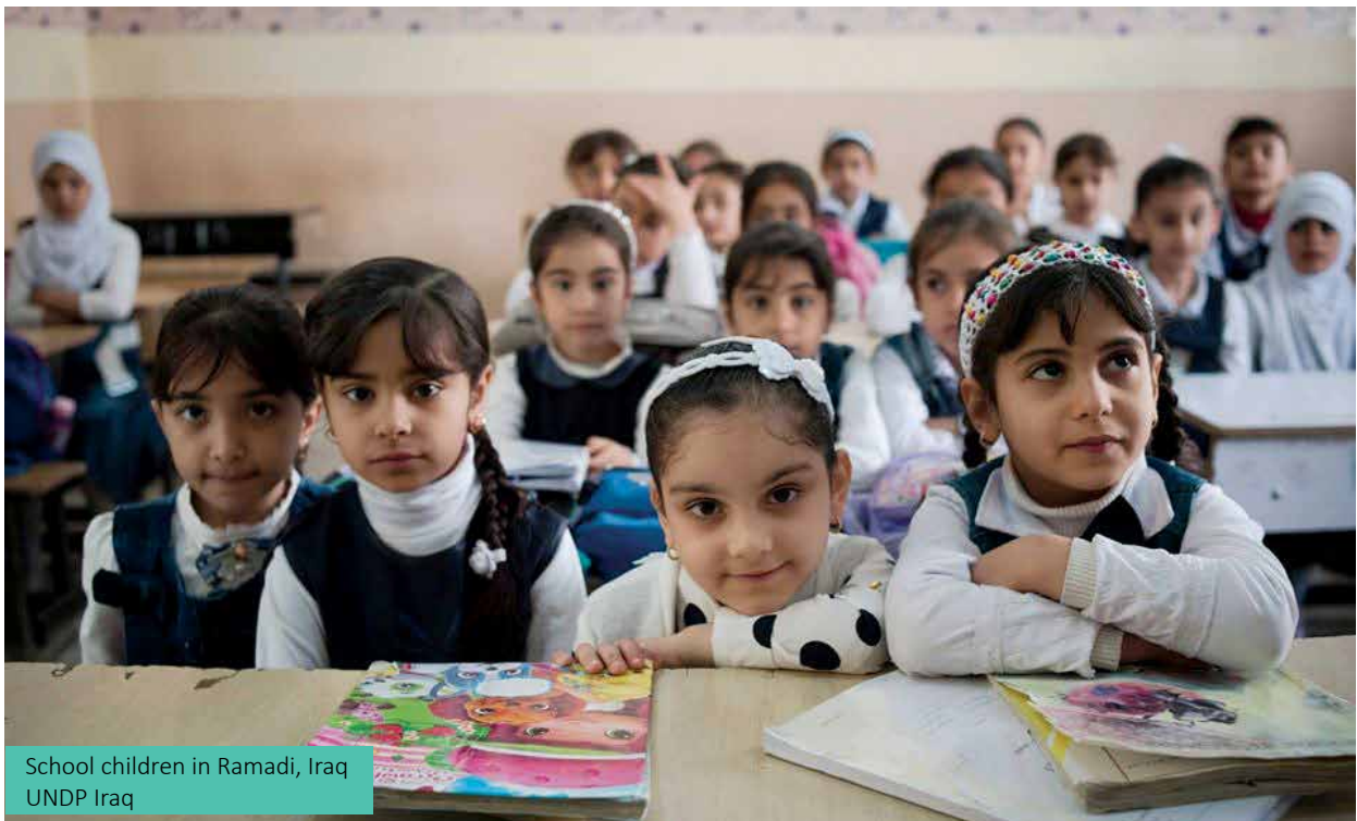
School children in Ramadi, Iraq