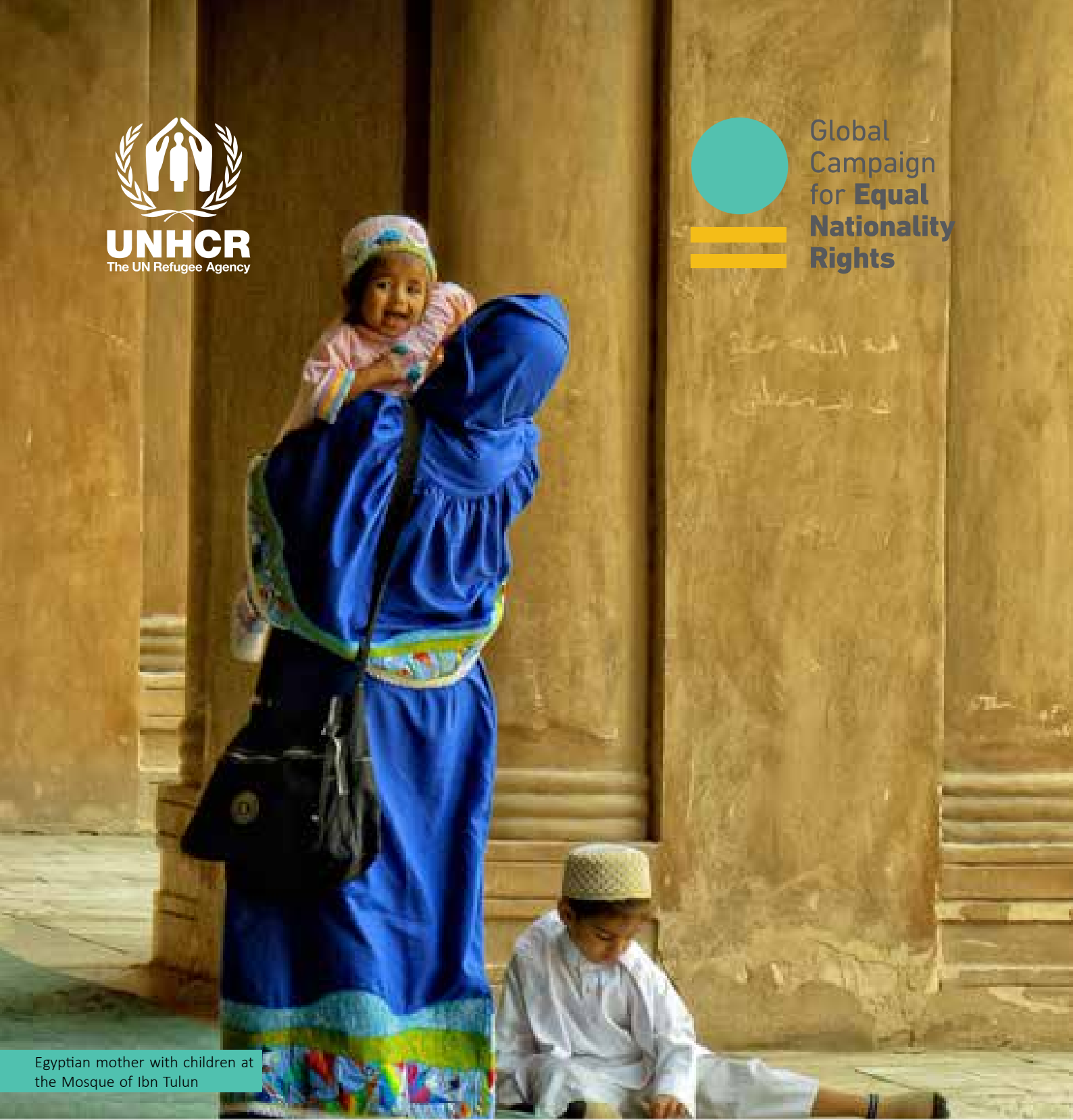
Egyptian mother with children at the Mosque of Ibn Tulun