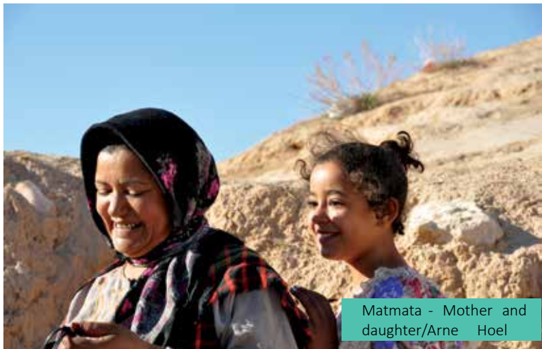
Matmata - Mother and daughter

The draft law was presented as the embodiment of Tunisia’s Constitutional commitment to uphold women and men as equal citizens, with the ability to confer nationality recognized as a core component of citizenship. The reform was also upheld as a positive step to bring Tunisia’s legislation in line with its commitments under international law, and coincided with the lifting of the country’s reservation to Article 9 to the Convention on the Elimination of All Forms of Discrimination Against Women.