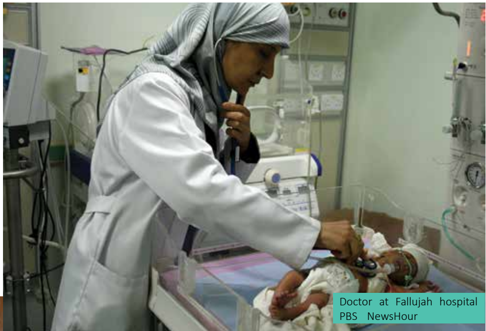
Doctor at Fallujah hospital PBS NewsHour

Upholding women and men’s equal right to confer nationality not only advances the health of their families, but supports the health of the nation, through preventive care and the treatment of communicable diseases.