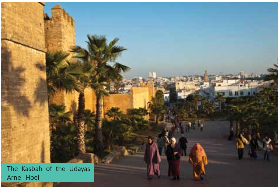
The Kasbah of the Udayas Arne Hoel

Though the country ratified CEDAW in 1993, it did so with a reservation to Article 9(2), due to gender inequality in the Nationality Code. At the time, the Nationality Code only permitted Moroccan women to confer nationality on their children if the father was unknown or stateless. During the country's CEDAW reviews in 1997 and 2003, the Committee called on the government to bring its Nationality Code in line with its CEDAW obligations.