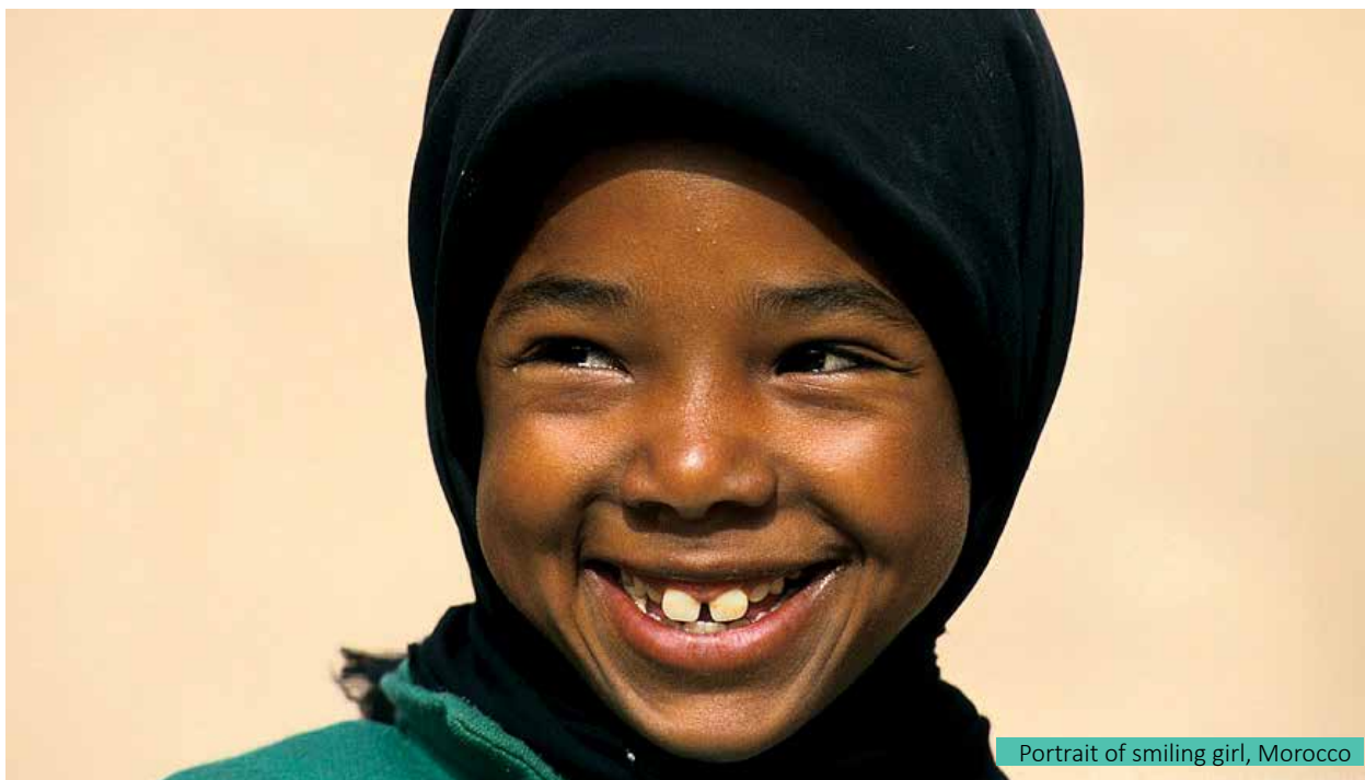
Portrait of smiling girl, Morocco