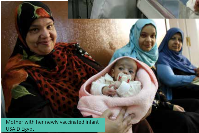
Mother with her newly vaccinated infant USAID Egypt