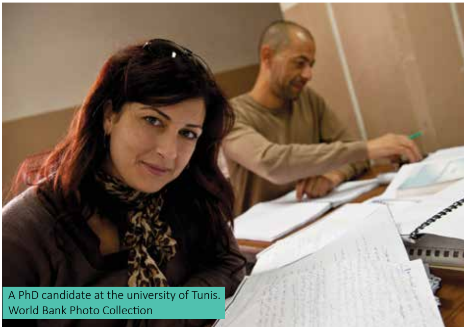
A PhD candidate at the university of Tunis.

Reforms advancing gender equal nationality rights had a dramatic impact on the ability of the children of women citizens and non-national fathers to secure employment and financial security. Lacking citizenship in their homeland, affected persons were incapable of being employed in a number of sectors, including in the civil service, one of the largest sectors for employment in many countries, and in professions requiring membership in professional syndicates reserved for citizens. Because of their vulnerable status, when affected persons could get work, it was not uncommon for them to be underpaid and exploited by employers. As previously described, the lack of educational opportunities for those without citizenship meant that many who excelled academically were incapable of pursuing their professional dreams.