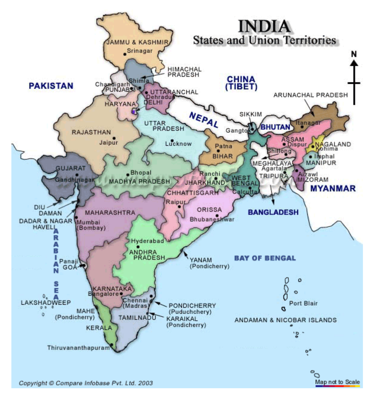
State & Union Territories