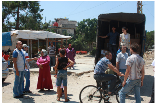
UNHCR staff distributing food kits to displaced families in Wadi Khaled – © UNHCR.