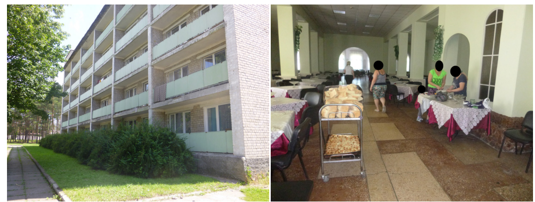
IPD Center, Sviatohisrk

because of lack of money. This was reported to be a problem all IDP-camps in Ukraine face. NGOs usually just help by providing food etc., but not coal. The Rinat Akhmetov Foundation had procured one wagon load of coal but this had been used for providing hot water and basic heating. Agreements with local coal mines are difficult because they demand payment in advance.<sup>529</sup>