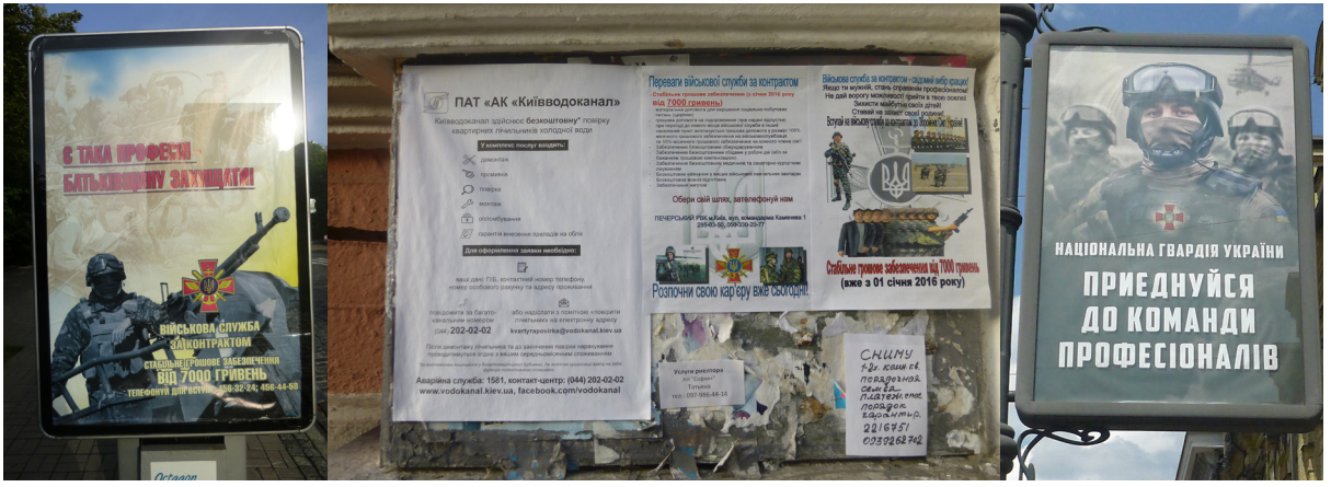
Recruitment posters for the Armed Forces in the streets of Kviv

The White Book of the Ministry of Defense of Ukraine underlines the creation of a flexible contract system in 2014 and the introduction of short-term contracts<sup>142</sup>. In 2015, according to the Ministry of Defense of Ukraine, 8,200 people had chosen the latter<sup>143</sup>. In June 2016, representatives of the Ministry asserted that conscripts were encouraged to sign contracts with the Army<sup>144</sup> and that retired officers can become contractors more easily<sup>145</sup>. Trained and experienced mobilized servicemen were also asked to continue military service on a contractual basis<sup>146</sup>. According to the White Book of the Ministry of Defense of Ukraine, in 2015 the system had enabled concluding contracts with 16,100 persons, of which 11,500 (71,4%) had been young civilians, 711 (4.4%) conscripted servicemen, and 3,800 (24.2%) mobilized servicemen<sup>147</sup>.