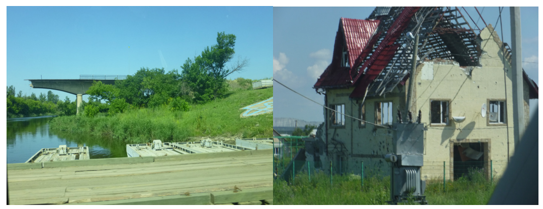
Remaining sings of the War (Periphery of Kramatorsk)

As of June 2016 interlocutors unanimously agreed that the security situation in the Donbass region had drastically changed since the beginning of the conflict in 2014. According to a representative of the Organization for Security and Co-operation in Europe (OSCE), the full scale military conflict which prevailed from mid-May to the end of August 2014 was no more<sup>300</sup>. Various interlocutors described the conflict as frozen<sup>301</sup>. Nevertheless, according to the International Organization for Migration (IOM), peace remained very fragile and violence was mounting<sup>302</sup>.