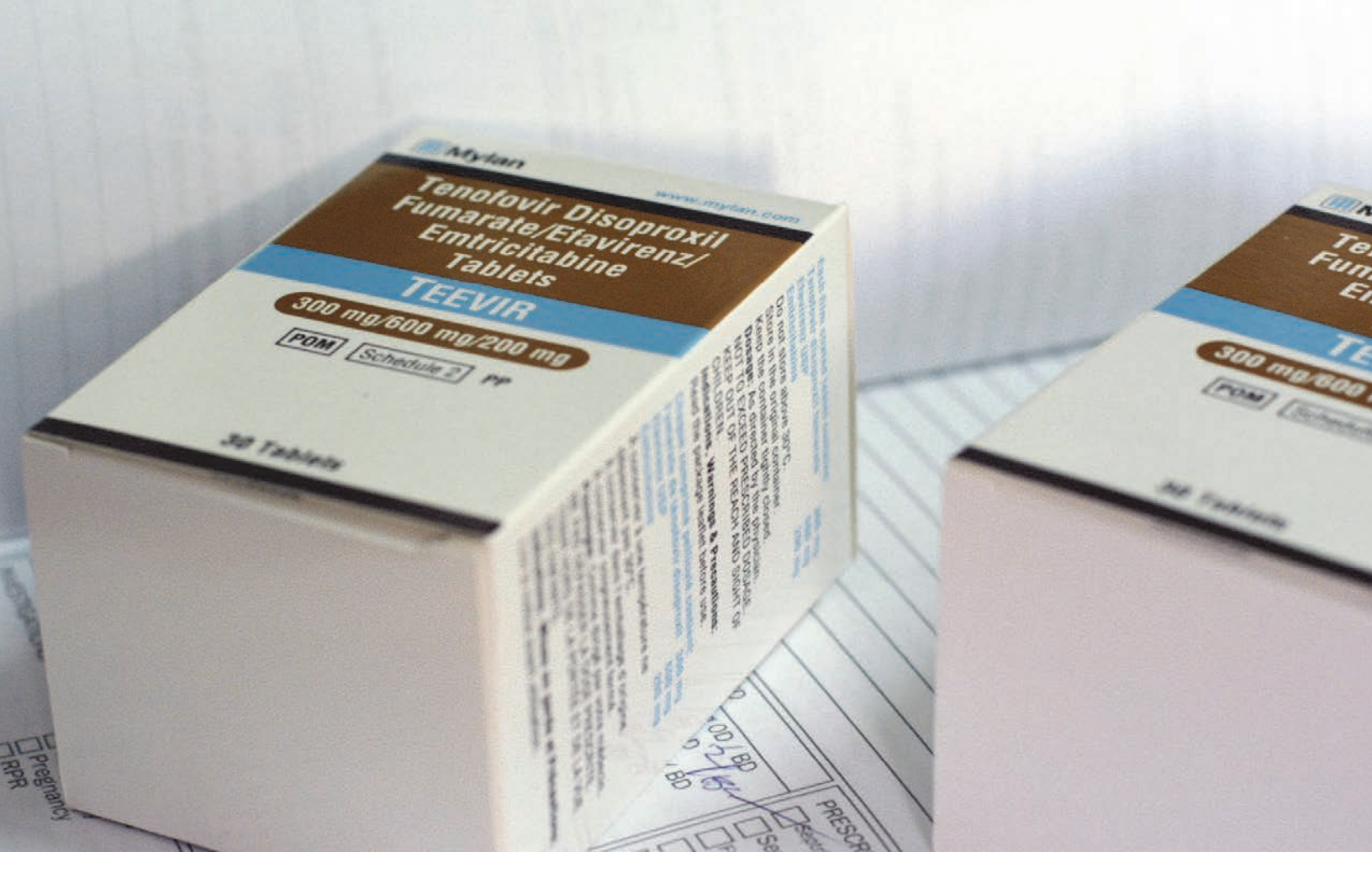
Antiretroviral drugs, like those pictured here, often do not have Braille symbols, making it difficult for blind people to identify various medications.

Persons with disabilities often experience a lack of confidentiality in HIV testing because of communication barriers and the need to involve a third person for interpretation. Representatives of the national organization of persons with psychosocial disabilities told Human Rights Watch that some individuals with psychosocial disabilities in mental health units in general hospitals are not ensured of their free and informed consent for HIV testing. Health workers and medical staff from three mental health units interviewed by Human Rights Watch reported varying application of HIV testing consent procedures in healthcare settings as well as confusion concerning the testing policy.