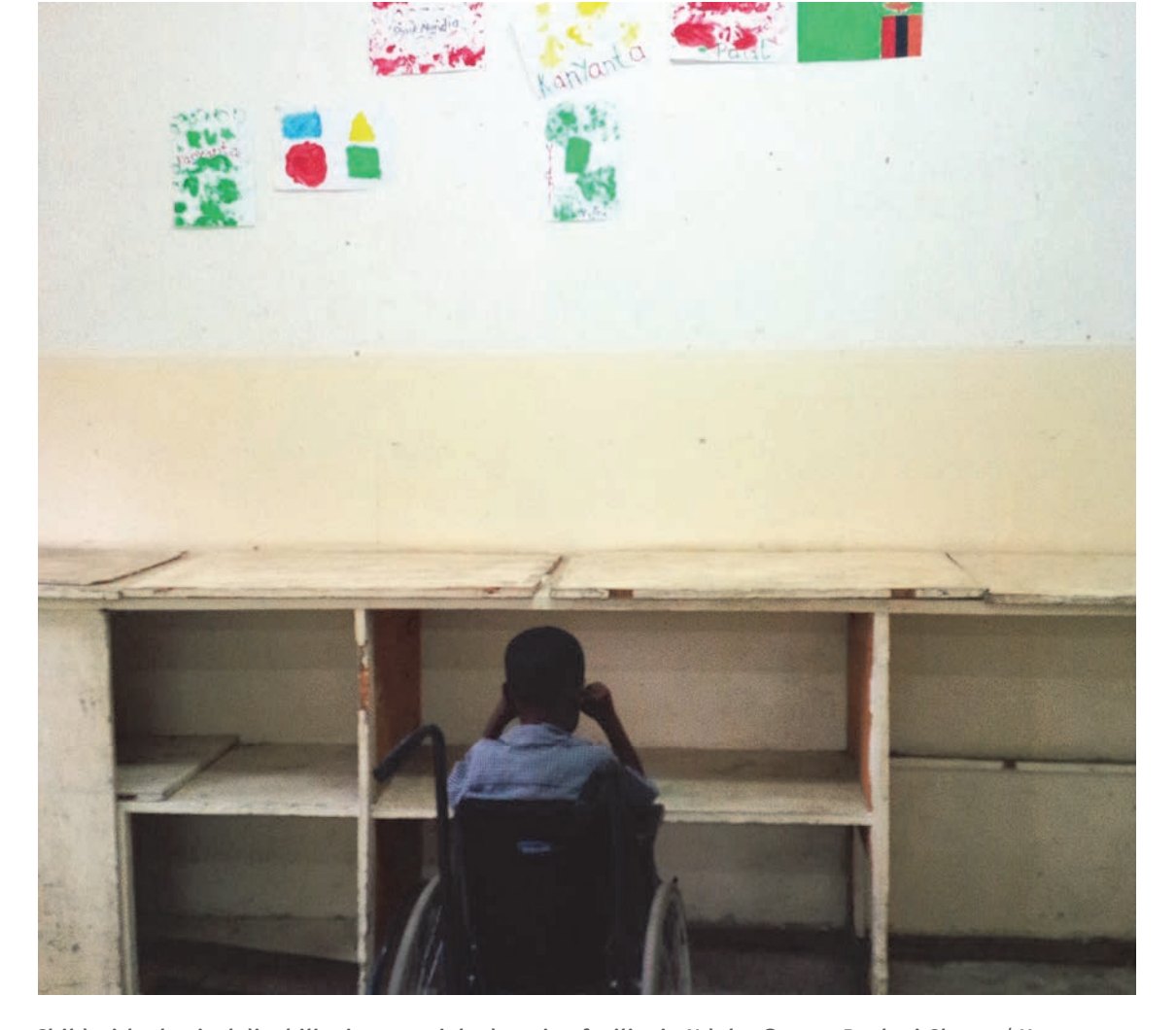
Child with physical disability in a special education facility in Ndola.

Special education teachers and head teachers also told Human Rights Watch that while their schools provide peer-based extra-curricular HIV prevention education to students through programs such as "Anti-AIDS Clubs" or "Safe Love Clubs," special education teachers are typically not involved in such initiatives and children with disabilities are often not encouraged to participate in these activities. As one teacher for deaf students said: "Sexuality and HIV education is just for the hearing and their teachers." Of the 44 students with disabilities interviewed, only a few had participated in such clubs. See Special education teachers and students with disabilities are also typically excluded from special