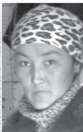
UNHCR / A. ZHORGBAEV / KG2-2010