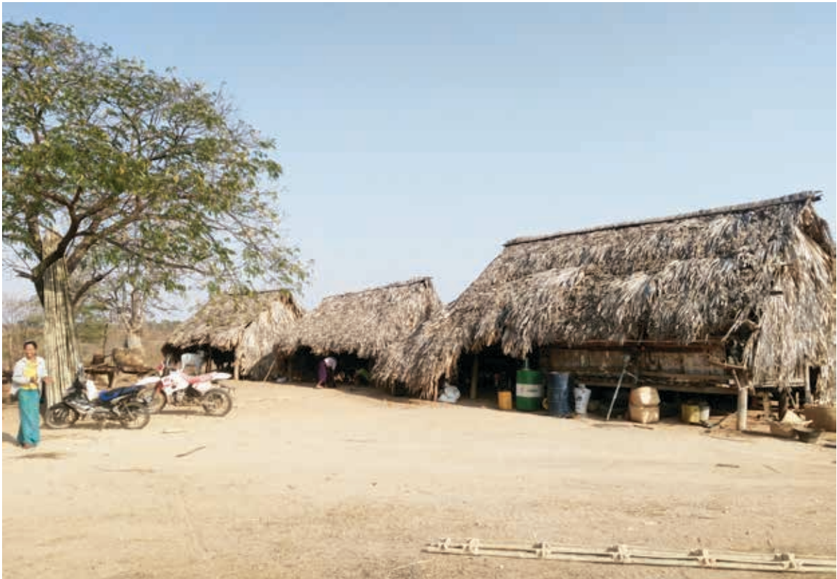
Houses located just outside Let Pa Kyin Village, Ngazun Township, Mandalay Region. Occupants are at risk of being evicted as the land on which the houses were built has been slated for confiscation for the development of the Myotha Industrial Park / April 2017.

In April 2017, FIDH observed that while some of the farmers who did not accept compensation, especially in Let Pa Kyin Village, continued to work on the farmland that they still considered their own, they lived in constant fear of bulldozers clearing their land at night. 191 In April 2017, a farmer from Let Pa Kyin Village showed FIDH his land, which had been excavated by MMID, making it impossible for him to work on it anymore as the top fertile layer of soil had been destroyed. 192 Another farmer in Let Pa Kyin Village said: "I still have some land but I cannot use it in the same way as before because the company machinery has flattened it and I cannot plow it." 193