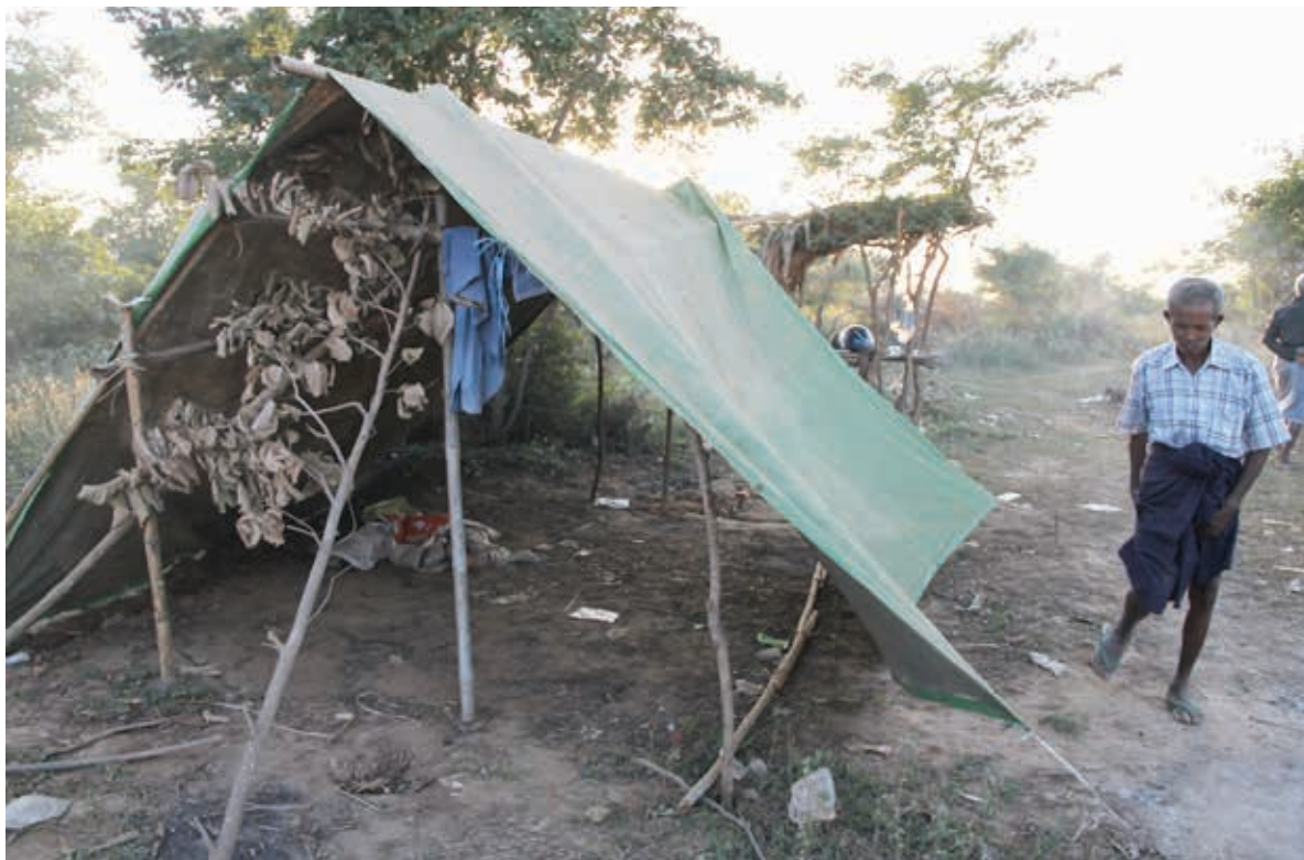
One of the huts built by villagers at a makeshift lookout camp near their farmland so they could guard against bulldozing in Ngazun Township, Mandalay Region / November 2014.

In response, farmers built makeshift lookout camps near their farmland so they could guard against bulldozing. 150 On many occasions, starting in August 2014, farmers stood in front of bulldozers and confronted workers attempting to clear their land. 151 One woman described the experience of confronting bulldozers on her farmland: “I was so worried about losing my land. I confronted the bulldozer even though I was afraid. I was more afraid of losing the land.” 152 Another woman explained that she had to run back and forth between two bulldozers to stop them. One man who stopped bulldozers on his neighbor’s land galvanized other members of the community to take action when police wearing riot gear accompanied the bulldozers. 153