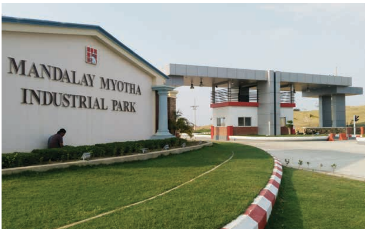
Main entrance gate to the Myotha Industrial Park in Ngazun Township, Mandalay Region / April 2017.

The Mandalay Regional government adopted the Myotha Industrial Park and Semeikhon Port master plan on 3 January 2013. 64 A week later, then-Mandalay Region Chief Minister Ye Myint signed the joint venture agreement with MMID. 65 The terms of the agreement include: