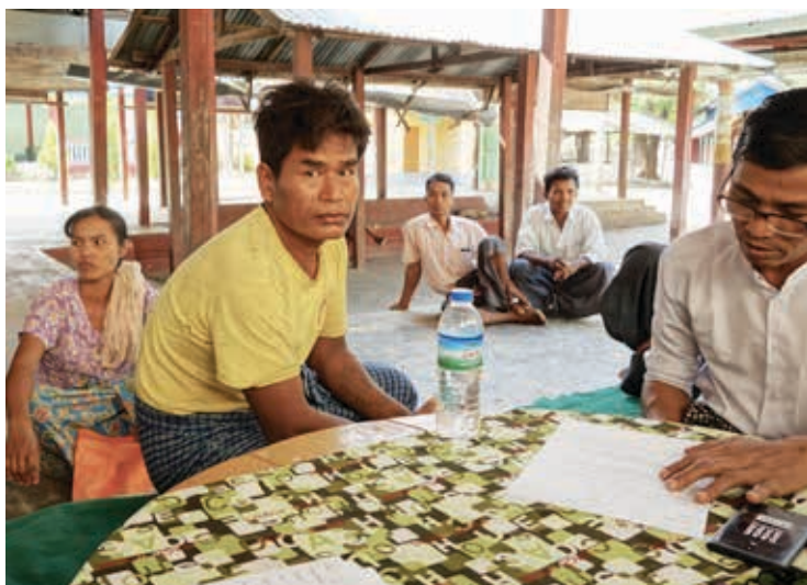
A farmer from Than Bo Village, Ngazun Township, Mandalay Region, during his interview with FIDH. He was detained for 13 months after being arrested on 23 April 2014 for confronting a bulldozer during land clearance operations / April 2017.

By February 2015, 55 farmers faced criminal charges for blocking the clearing of land for which compensation had not yet been agreed upon. 174 One farmer from Than Bo Village, who stood in front of bulldozers for one month, told FIDH that he was detained for 13 months after being arrested on 23 April 2014 on charges under Articles 143, 147, 447, and 505(b) of the Criminal Code. He said: "While I was in jail the company confiscated all of my land. I did not get any money. When I got out of jail I had nothing left." 175 Farmers saw legal action taken by the authorities as a form of intimidation to force them to accept compensation. 176 All 10 farmers from Than Bo Village have since been released and to date, no new arrests have been made in the Myotha Industrial Park area since the NLD-led government took power.