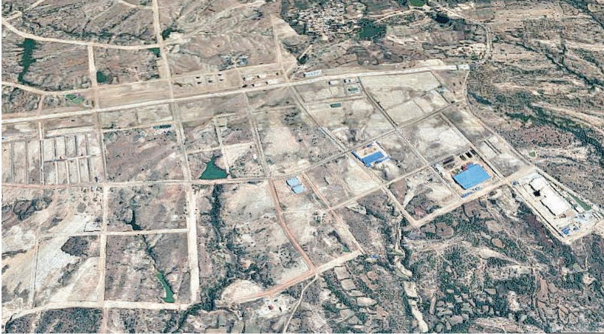
Satellite image showing the area where the Myotha Industrial Park is being developed in Ngazun Township, Mandalay Region / 2017.

The land confiscation that occurred to make way for the development of the Myotha Industrial Park has resulted in serious violations of economic, social, and cultural rights, as well as civil and political rights, for affected individuals and communities. In addition, the land confiscation process exposed significant flaws in the legal framework related to land management and its enforcement by the authorities, which fell demonstrably short of international standards.