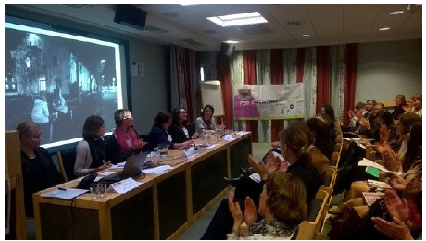
EWL #WomensVoices European Dialogue 2 June 2016

Following up on the #womensvoices European Dialogue, and ahead of the European Council of June which included migration on its agenda, the EWL and its members sent letters to the EU decision-makers with concrete demands: "We call on you to bring high attention to our report and its concrete demands. In particular, we call on you to ensure that the EU and all its member states ratify and implement the Istanbul Convention, without any reserve, and mainstream the specific needs of refugee and migrant women through the 5 Ps Framework developed in our report. We call on you to ensure that transit/accommodation centres are built and staffed in a gender-sensitive manner, and to use our check list 'Implementing a gender-sensitive humanitarian response' at all levels. We call on you to ensure that EU and national asylum procedures comply with the UNHCR Guidelines on International Protection and include a gender perspective in all aspects, according to our check list 'Engendering the asylum systems'."