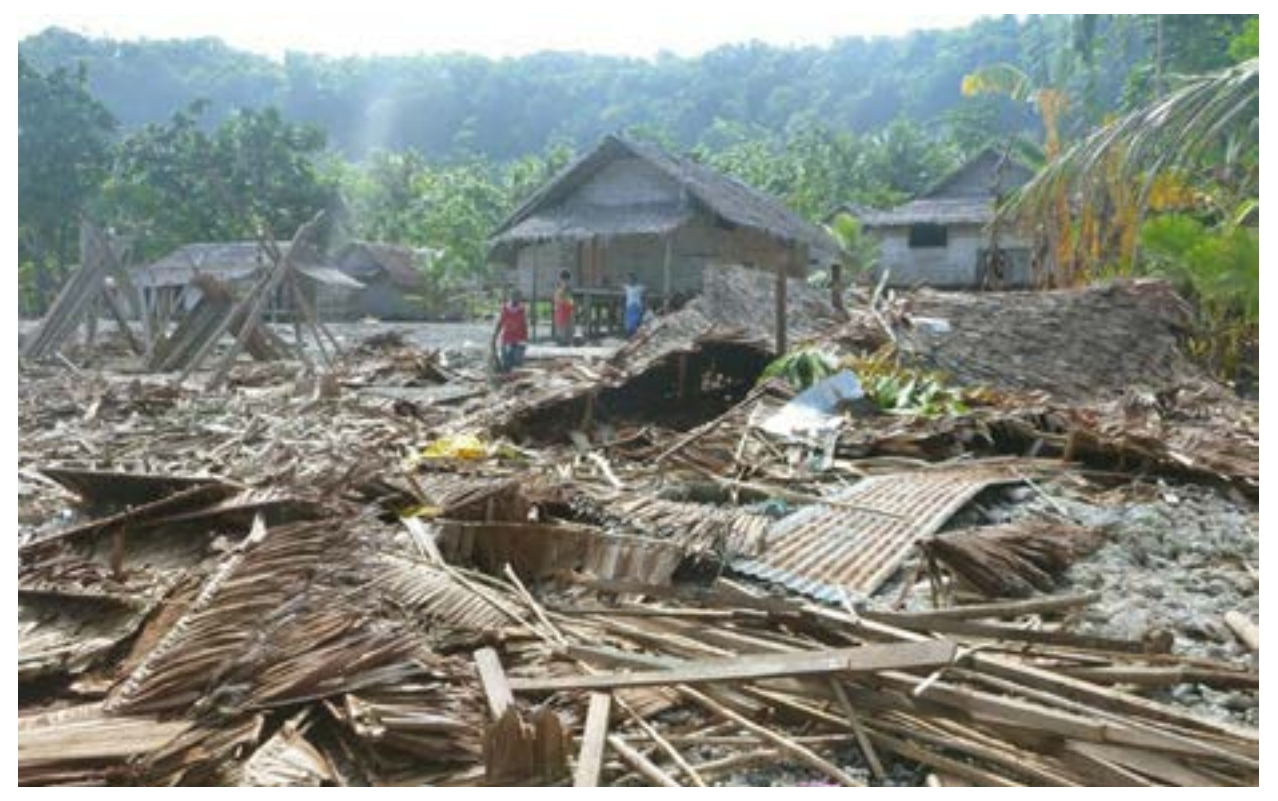
Destruction caused by the earthquake in Santa Cruz Island, Temotu Province, Solomon Islands.

This pledge was welcomed by several states and provides the basis of the Nansen Initiative. The first sub-regional consultation occurred in May 2013 and was hosted by the Cook Islands. This paper was prepared as an input into the ongoing Nansen Initiative process and the key findings of an early draft were presented at the Pacific consultation.