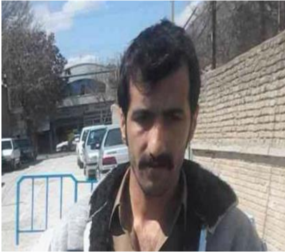
Alireza Rasouli © Private