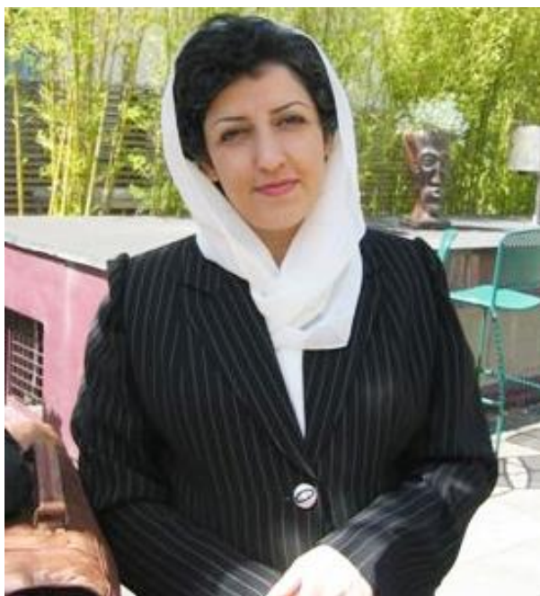
Narges Mohammadi

“I cannot fathom why security and police officials [referring to female officials in this case] have to be present when a patient is taking a shower or undergoing examinations for which she needs to take her clothes off.