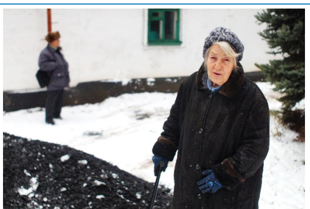
In government controlled areas, UNHCR provided the most vulnerable residents living along the 'contact line' with UAH 10,000 the form of cash. Beneficiaries were then able to choose their preferred winterization support by purchasing warm clothes, coal, heaters, among other supplies. The program targeted persons with heightened protection vulnerabilities, including persons with legal and protection needs, persons with serious medical conditions, unaccompanied or separated children, elderly persons and/or survivors of sexual and gender based violence.