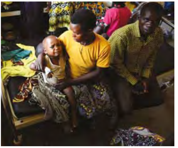
閱讀《2017年全球難民安置需求展望報告》 (只提供英文版) Read The Projected Global Resettlement Needs 2017 report (English only)

resettlement submission in 2015 are United States (82,491). Canada (22,886), Australia (9,321) Norway (3,806) and the United Kingdom (3,622).